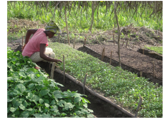
Vegetable gardens grown by war-affected youth in Gbarnga, Bong county: 2167-LIB Youth for Development and Pro- gressive Action