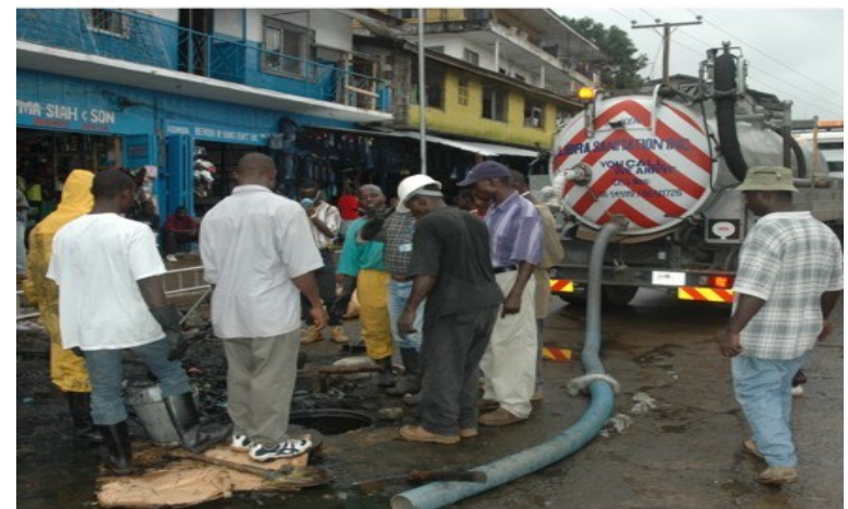
Libra sanitation services at work in the streets of Monrovia: 1773-LIB Libra Sanitation