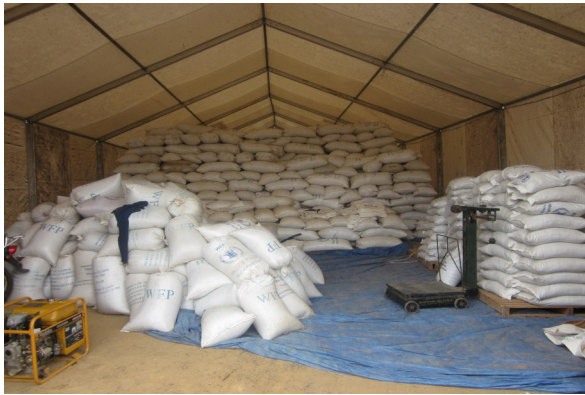
Rice produced and stored for the WFPA P4P program: 2220-LIB