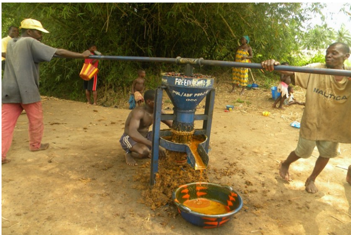
Grantees demonstrating the use of Freedom Mills used to extract palm oil in Bong county: 1843-LIB Pulukpeh Multipurpose Cooperative Society