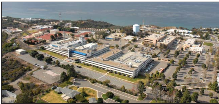
This aerial view of Naval Warfare Systems Command Systems Center in San Diego, Calif., shows the diversity of building types addressed through an Energy Savings Performance Contract awarded and managed through the U.S. Army Corps of Engineers.

The U.S. Army Engineering and Support Center, Huntsville, awarded a $12 million Energy Savings Performance Contract for the SPAWAR unit in January 2011, and with work completed in February, they are starting