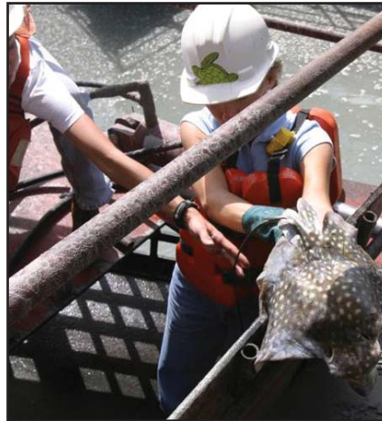
Crew members keep watch over marine life and work to protect endangered sea turtles during beach replenishment operations.

These NMFS regulations require the Corps to perform its dredging during the