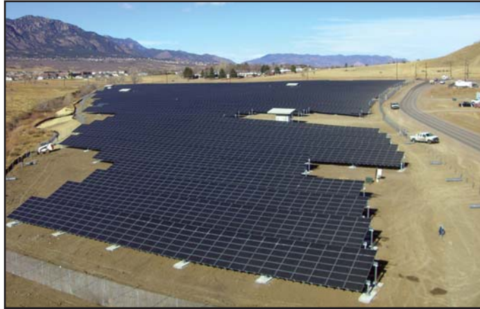
At Fort Carson, Colo., the Army partnered with a local energy provider to build this photovoltaic solar array on top of a closed landfill. A similar project at White Sands Missile Range in New Mexico, was awarded by the Corps in December and will provide 4.44-megawatts of installed photovoltaic capacity saving 10 million kilowatt hours of electricity and $930,000 annually. The White Sands project will be the largest renewable energy project in the Army, at more than double the size of this array at Fort Carson.

Thank you for all you do to support our Environmental efforts...we are not just BUILDING STRONG® , but BUILDING GREEN!