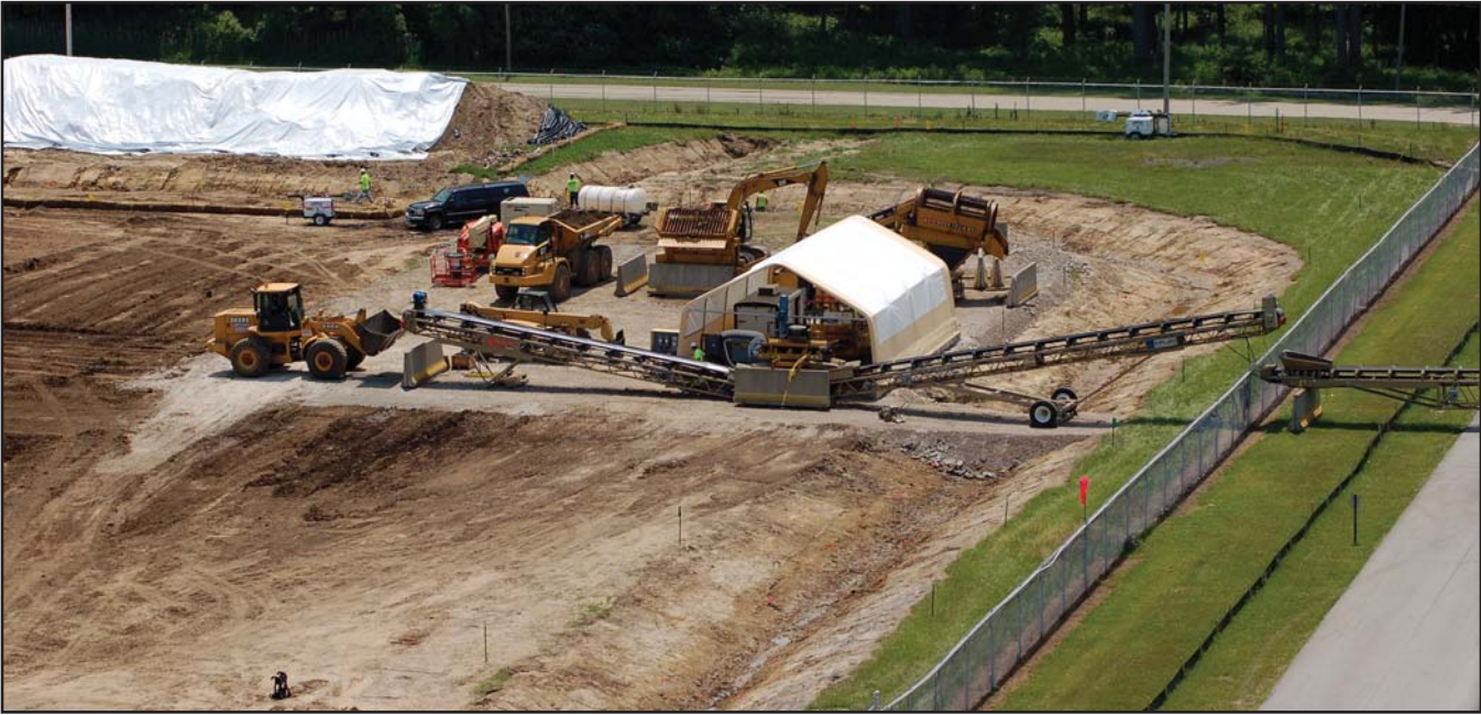
This aerial photo shows an innovative soil sorter used at the Painesville site near Cleveland. The equipment minimizes the amount of material transported for off-site disposal.