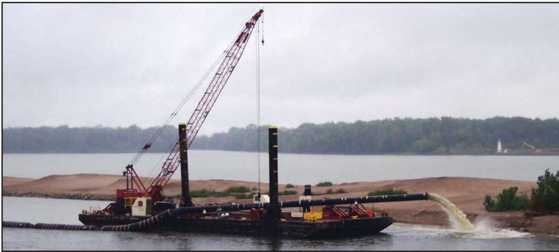
Sandbars and island habitats are created in various shapes and sizes

“In the future, we hope this will be the way we do business,” Johnson said. “Eventually we hope to use the Dredge Potter not only for navigational purposes but for environmental management purposes as well.”