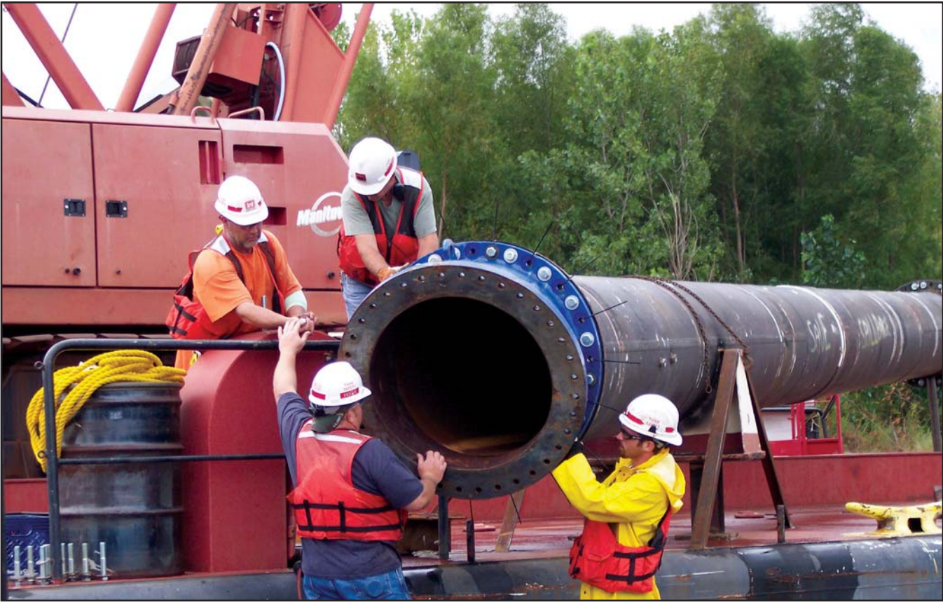
Dredge Potter crew assembles flexible floating dredge pipe. As part of a pilot project during this year's dredging season, the St. Louis District, U.S. Army Corps of Engineers reused dredged material to create sandbars and island habitats for endangered species.