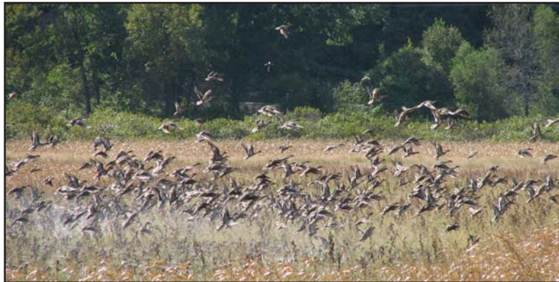
Waterfowl rise from the wetlands at the confluence of the Mississippi and Illinois rivers.

"Wetlands play a crucial role in many of the things we value," Johnson said. "We need to have an environment that meets the needs of humans and of wildlife, and honestly that can't be accomplished without healthy, functioning wetlands."