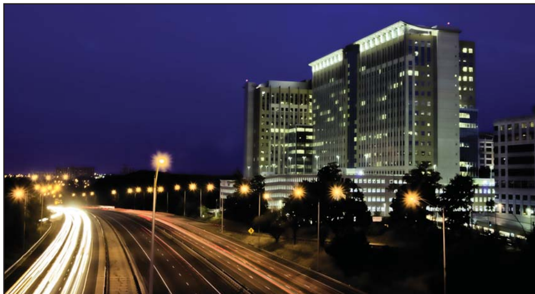
A nighttime view of the $1 billion Department of Defense Office Complex project at the Mark Center.

Several visible green elements were also incorporated into the