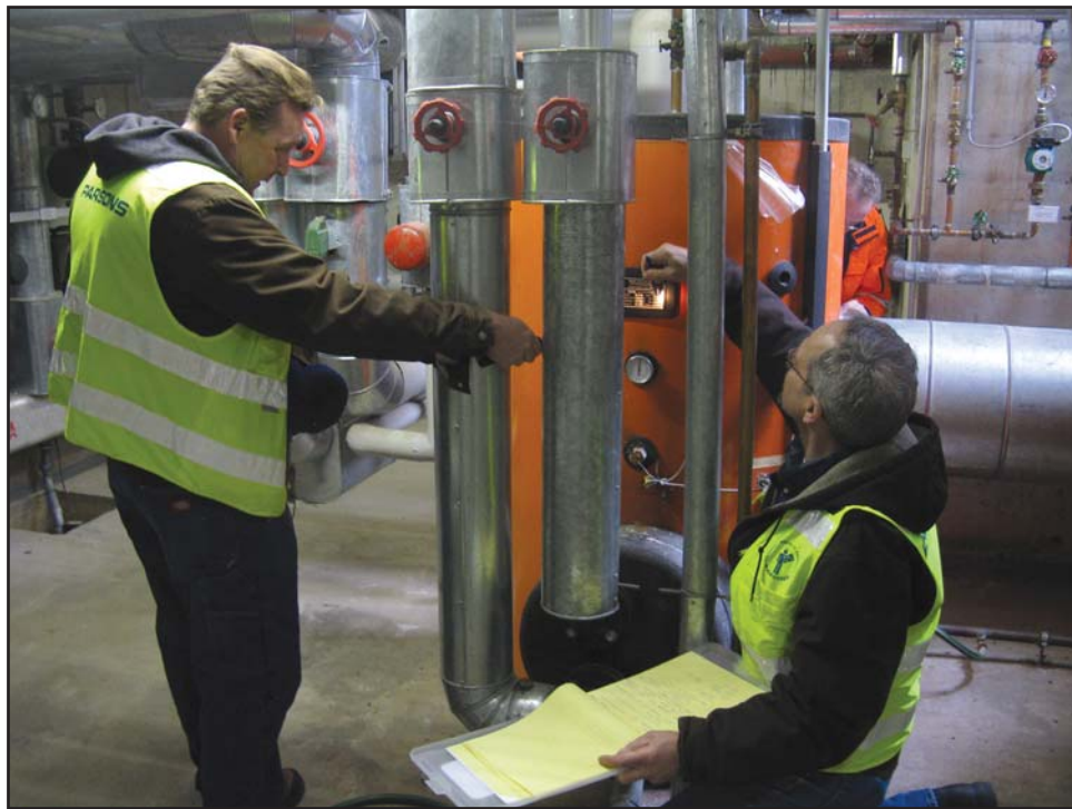
Project team representatives perform an inspection of the mechanical systems at Sembach Kaserne as part of an extensive energy audit being managed by the U.S. Army Corps of Engineers Europe District. The Sembach installation audit is being conducted as part of an energy master planning project aimed at achieving net-zero energy installation status by 2025.

“We will take the development plan for Sembach under the master plan for Kaiserslautern and ask the planners to give us a vision of what the garrison will look like by 2025,”