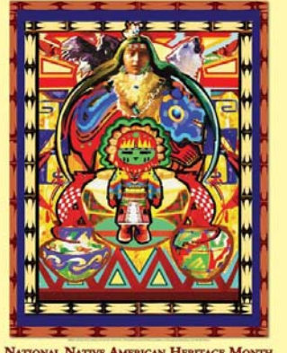
NATIONAL NATIVE AMERICAN HERITAGE MONTH