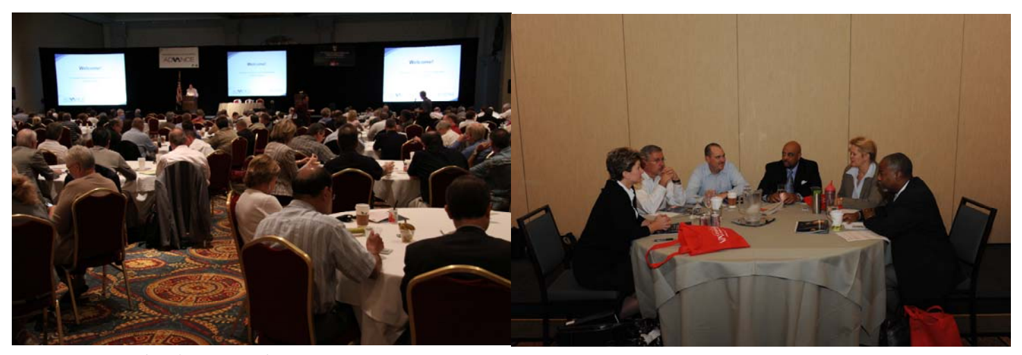
Attendees listen in at the Las Vegas session.