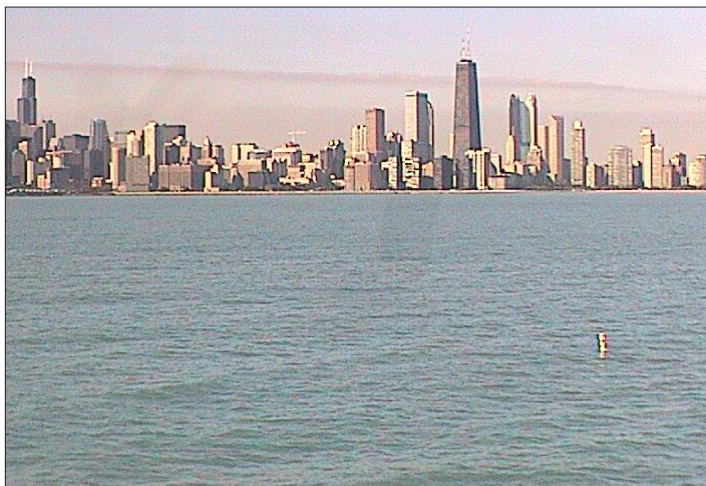
WebCam photograph of the Chicago skyline from the Chicago Met Station.