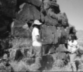
The Tribes helped the refuge identify and protect petroglyphs and other refuge resources.