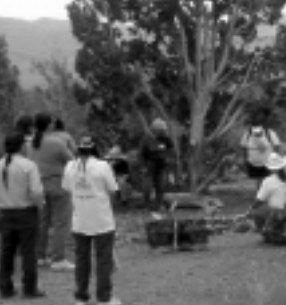
On site tribal tours provided a meaningful two way exchange of information.

Sometimes, big refuges must confront large-sized challenges. At Desert National Wildlife Refuge Complex, the refuge staff and planners faced the daunting task of trying to engage more than 18 Tribes spread over four states in the planning process. A number of laws mandate federal agencies to coordinate with Tribes when planning projects; as a result, the Tribes are often inundated with competing requests to participate in meetings and review documents.