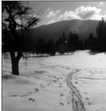
The CCP dealt with winter recreation access issues.

She recalls three particularly tough compatibility issues. "First, we had to deal with the Air Force, which had used the refuge for survival training for 30 years. They understood why training was not compatible, agreed to a five-year phase out, and have relocated training off of the refuge."