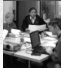
Hanford Reach workshop participants helped write objectives to meet management goals.