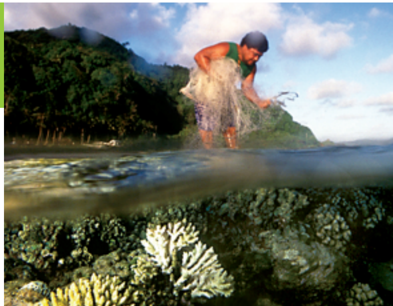
CORAL REEF HABITAT. A fisherman tries his luck with a simple net in American Samoa.