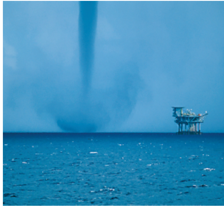
NATURAL PHENOMENON. A rotating column of air (similar to a tornado) creates this water spout in the Gulf of Mexico near an offshore oil rig.