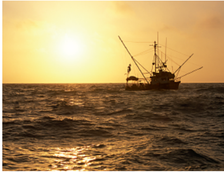
THE DAY'S CATCH. A commercial fishing vessel off the coast of Santa Cruz, California returns to port.