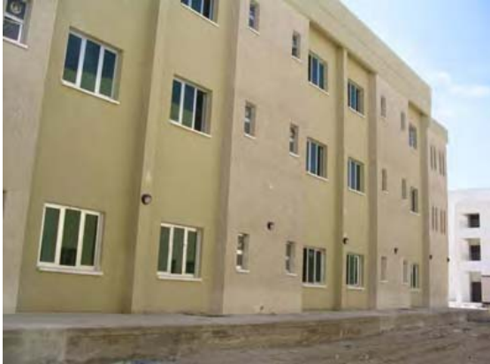
Figure 5 BPA Language Building A

Figures 5, 6, 7, and 8 show the Baghdad Police Academy.