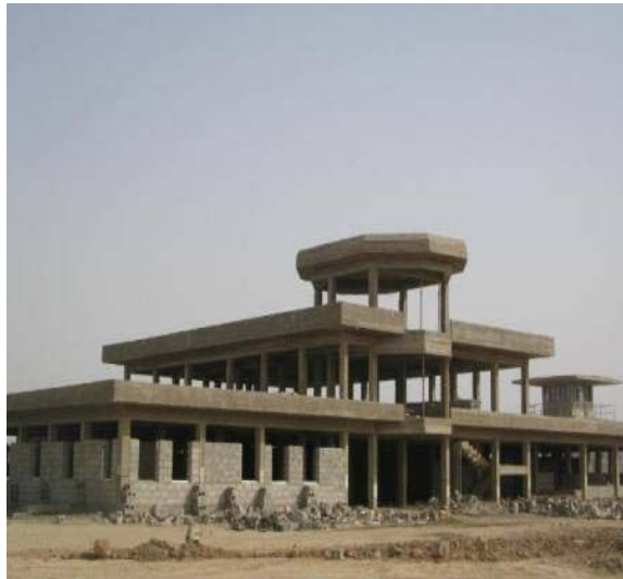
Figure 10 Task Order 7 - Kahn Bani Sa’ad