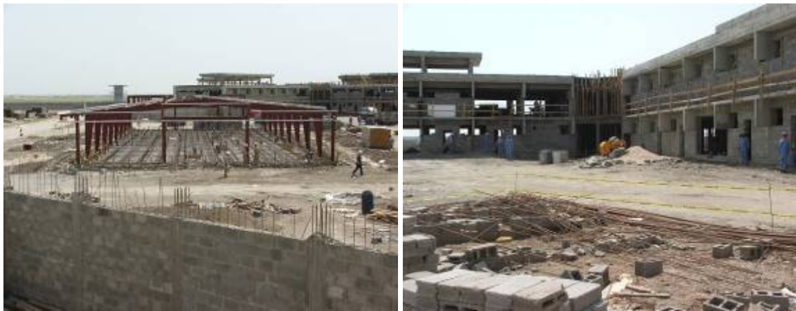
Figure 11 Task Order 8 - An Nassriya Prison