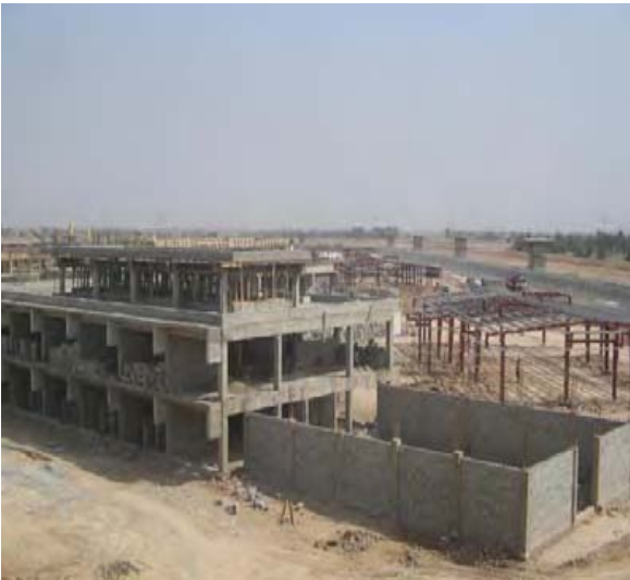
Figure 9 Task Order 7 Kahn Bani Sa’ad Building 6, Wing 3 Building 02

Figures 9 and 10 show the Kahn Bani Sa’ad facility.