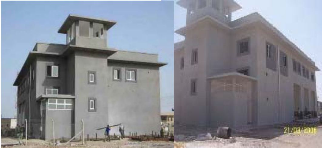
Figure 3 Task Order 51 – Fire Station at Husainea

Figures 3 and 4 show two of the fire stations built under Task Order 51.