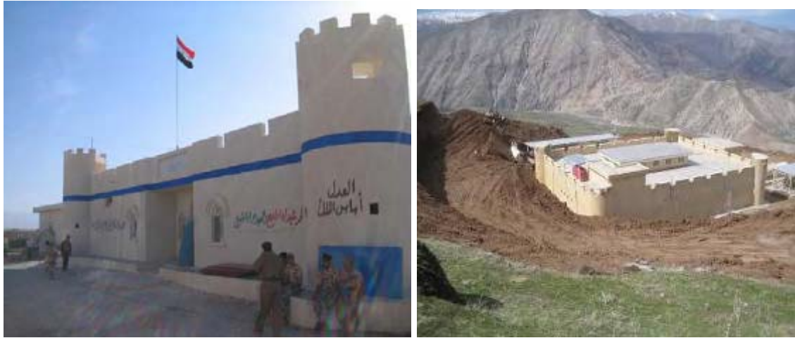
Figure 1 Task Order 34 – Border Fort at Arafat

Figures 1 and 2 show border forts that were built under Task Orders 1 and 2.