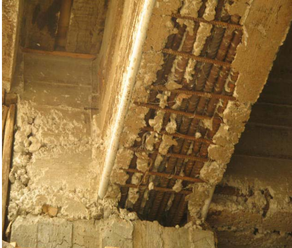
Figure 8 BPA-Improperly placed and exposed reinforcement bar and PVC conduit