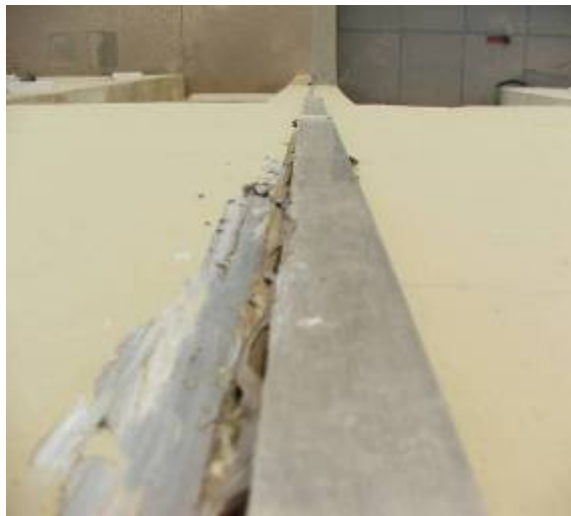
Figure 7 BPA Improper Plumbing Installation in cadets' barracks and expansion crack on rear side of instructors' barracks