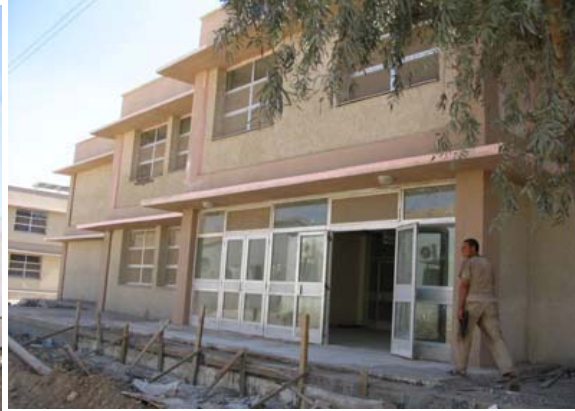
Figure 6 BPA Classroom Building B