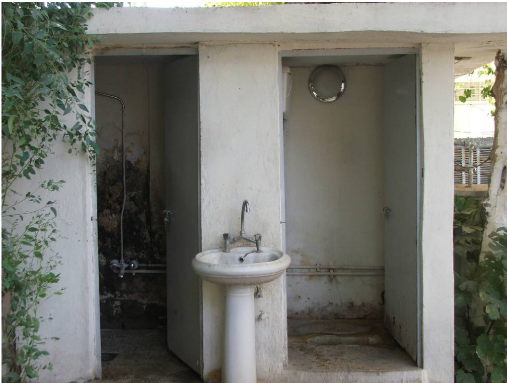
Site Photo 15. Frontal view of bathroom, which should have included 10 individual showers, 12 toilets, 10 urinals, 10 sinks, and a changing room.