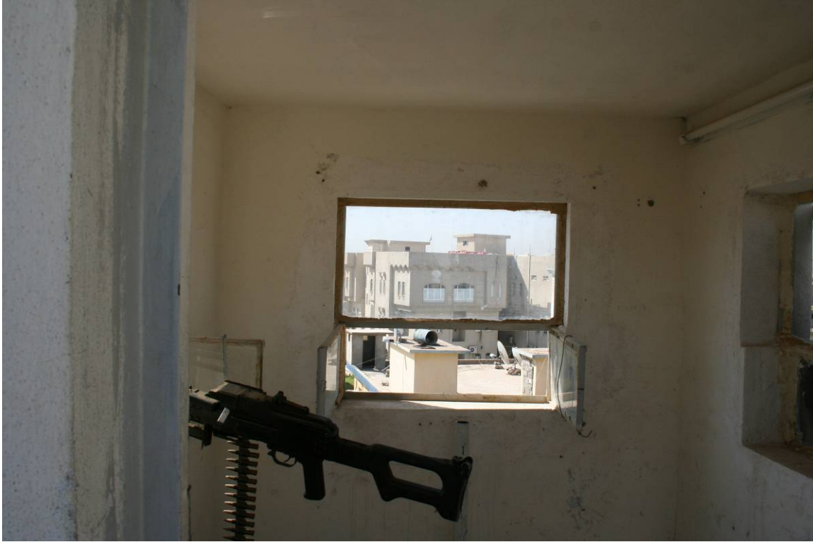
Site Photo 1. Contrary to contract requirements, four guardhouses were built without a fan, but with an extra window which increases the exposure of the guards.

On-site photos taken 3 August 2006 by SIGIR Inspectors are included in this report. Although the photos are descriptive, each photo includes a short narrative to explain the deficiency.