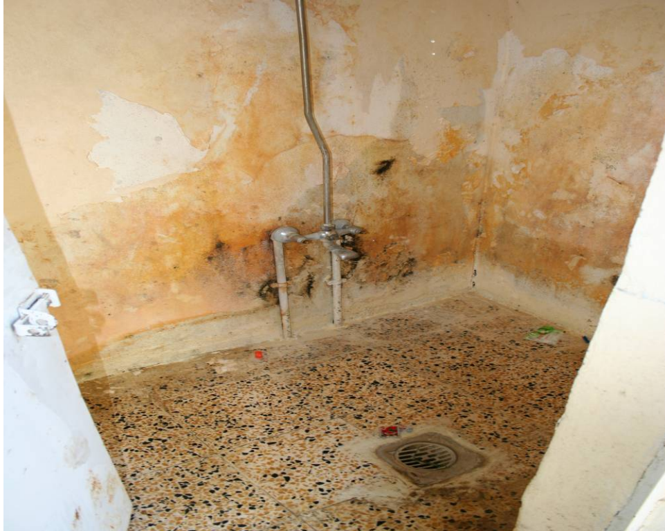
Site Photo 7. The shower wall was painted with plaster versus being grouted with tile from floor to ceiling as required.