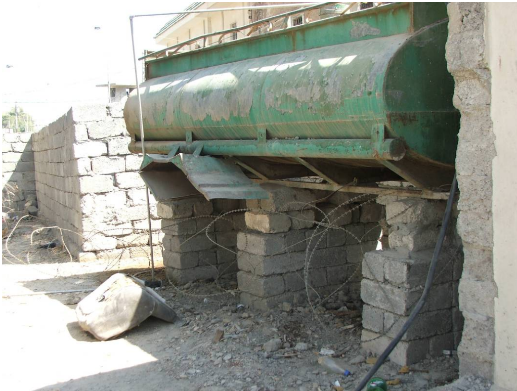
Site Photo 19. Old fuel truck tank used to supply the generator placed by the IP.