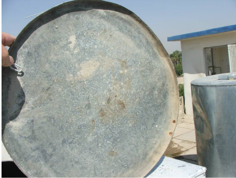
Site Photo 4. Lid from existing galvanized tank showed substantial corrosion.

Throughout the facility, construction of windows and doorways was poorly completed. Window and door frames should have been removed and roughed in with blocks or other suitable framing material to facilitate flush finish work with plaster or other appropriate wall board material.