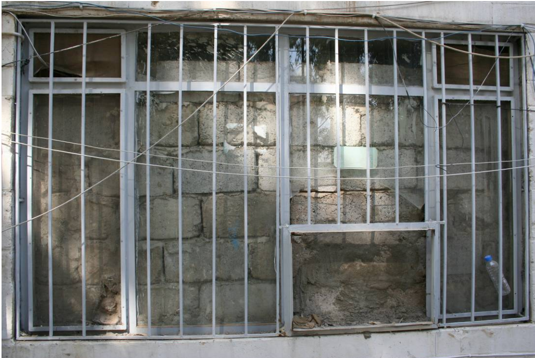
Site Photo 5. Blocks with only horizontal mortar joints merely stacked outside a window.

Throughout the facility, construction of windows and doorways was poorly completed. Window and door frames should have been removed and roughed in with blocks or other suitable framing material to facilitate flush finish work with plaster or other appropriate wall board material.