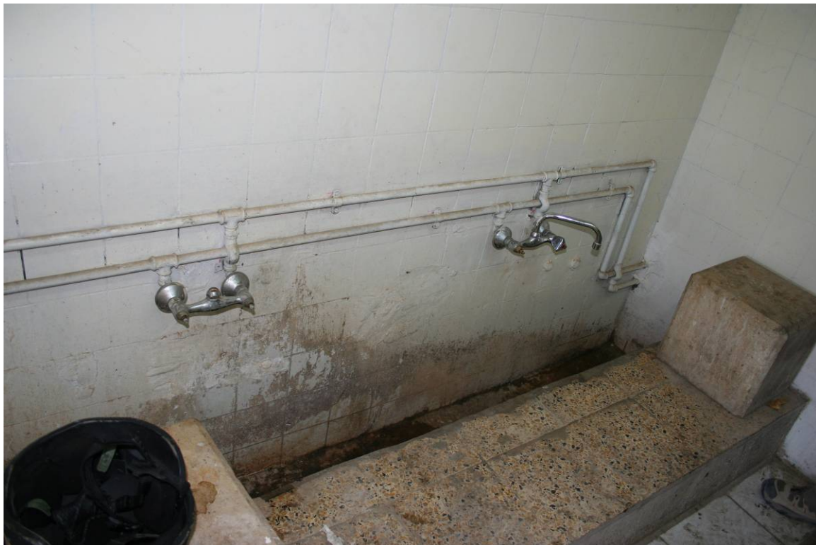
Site Photo 8. Existing wall tile was painted and existing leaking faucets were not replaced. Left faucet was capped/disabled instead of being replaced.