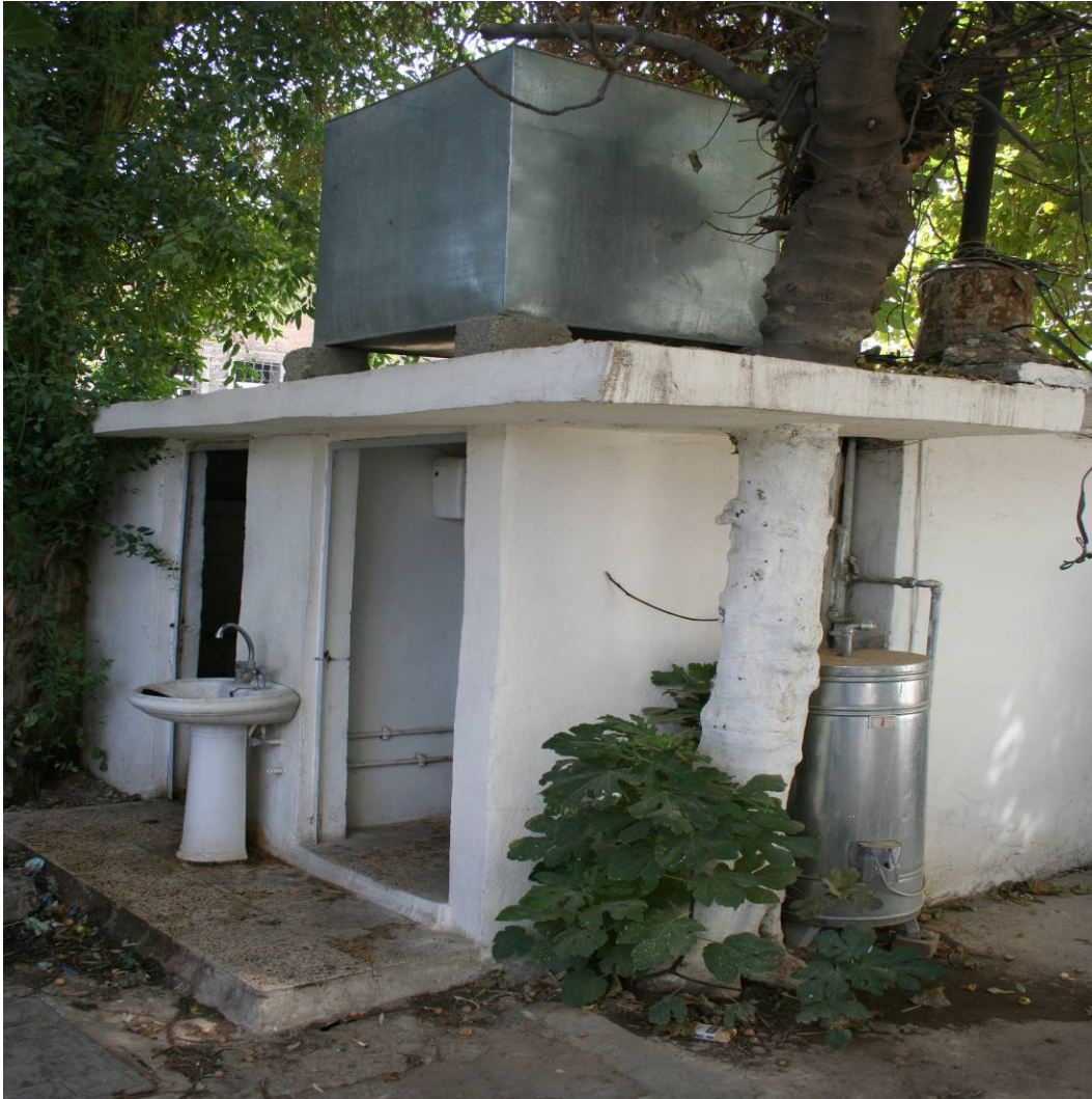
Site Photo 10. “Shady Construction” trees were not removed when the new latrine was built.

The contractor did not replace the main septic tank with a new tank three times the volume as required in the contract. Rather, the contractor added additional tanks of an unspecified and unverified size to the system. Such a course of action was outside of the design requirements. Concrete work to cover connecting pipe trenches was poor and manhole covers were generally nothing more than make-shift pieces of metal or wood. In addition, there was no evidence to support whether the underground sewer lines and system were inspected, repaired, and pressure tested as required by the contract.