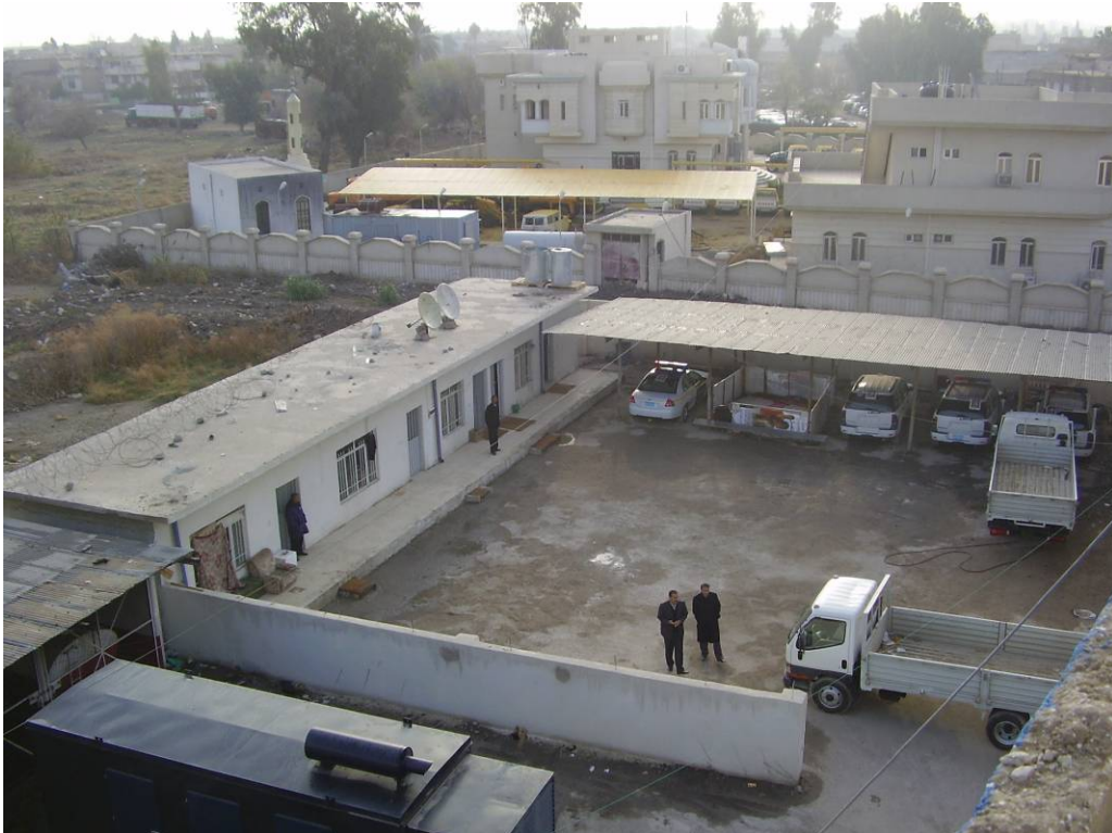
Site Photo 17. Generator was delivered (bottom left), but never connected and load tested by the contractor.