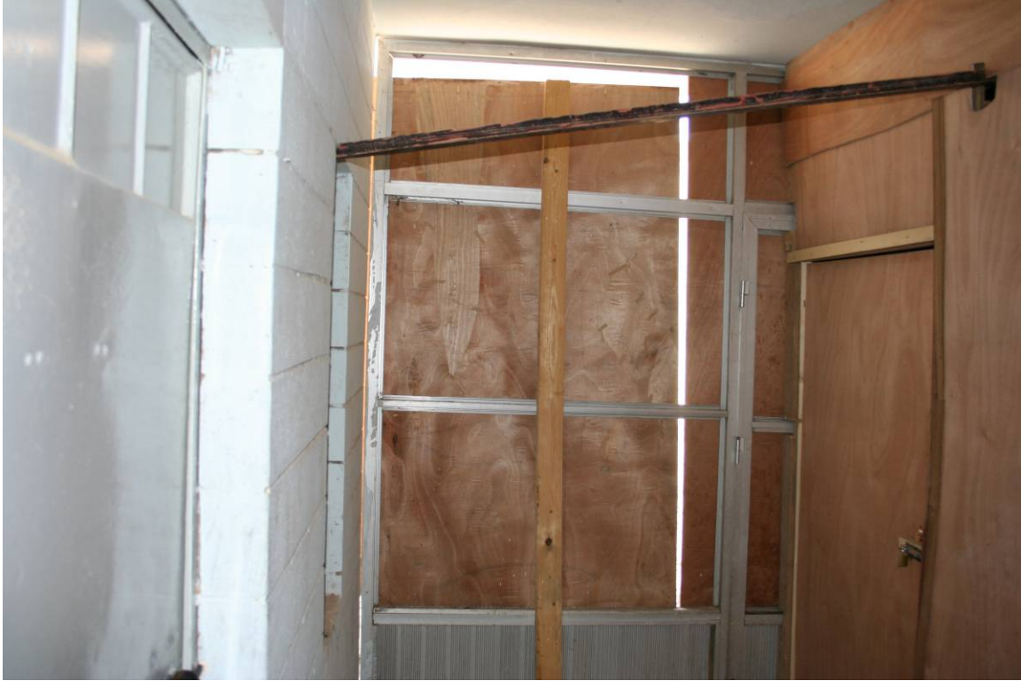
Site Photo 6. Plywood used to enclose metal frame was crudely held in position by tacking to only one piece of 2 by 4 lumber. The fit was not weather tight.

The SOW called for tiled and grouted walls from floor to ceiling and new piping, fixtures and faucets in latrines and showers. However, contractor performance was generally substandard in the bathrooms observed during our on-site visit.