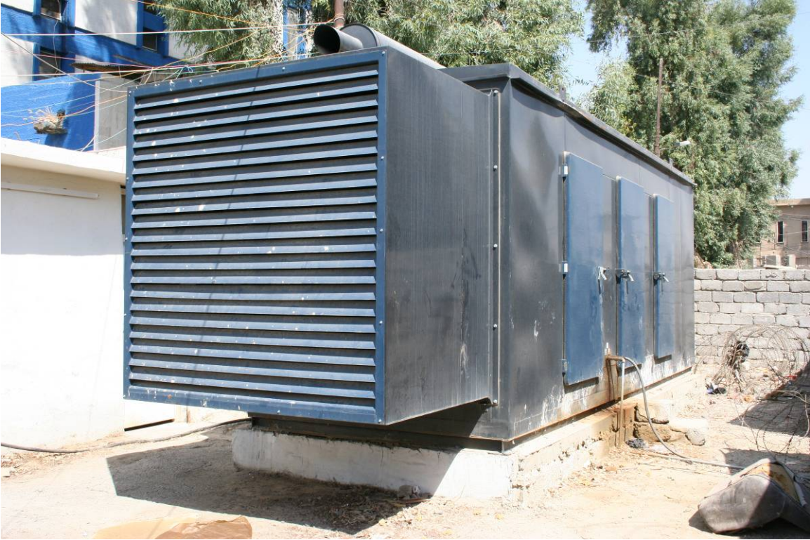
Site Photo 18. Final site, where the generator was placed by Iraqi Police (IP).