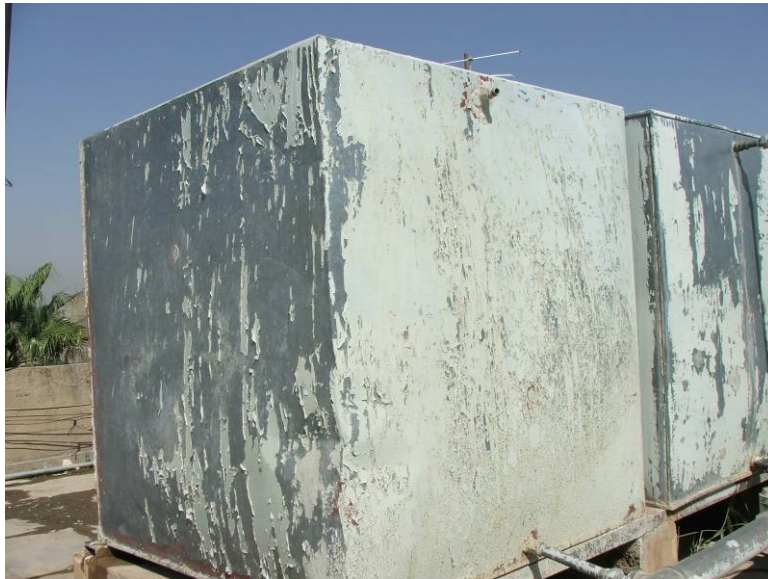
Site Photo 3. Existing water tanks left in place versus installing new units as required.