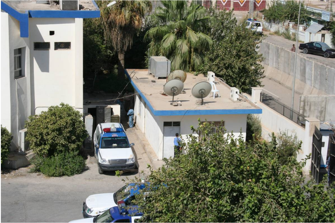
Site Photo 16. Only two (left edge of rooftop) of six split-unit air conditioners required by the SOW and BOQ were installed in the new reception center.