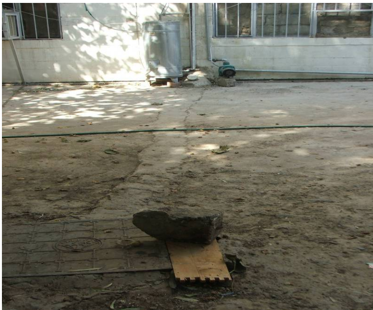
Site Photo 12. Manhole cover made of tin/wood and concrete work over the trench which was substandard.

The contract required the contractor to clear and remove all existing debris and rubble at the site location defined as each building's interior, exterior, roof, and perimeter. In addition to soil and waste material, the contract specified that unused hangers, wires, cable trays, conduit, plumbing, damaged ductwork, and all inserts from ceilings and walls were to be removed. Lastly, the contractor was required to provide a final cleanup of all buildings. At the time of our site visit, there was a substantial amount of debris lying about the facility and it appeared that a final cleanup was never conducted (Site Photos 13 & 14).