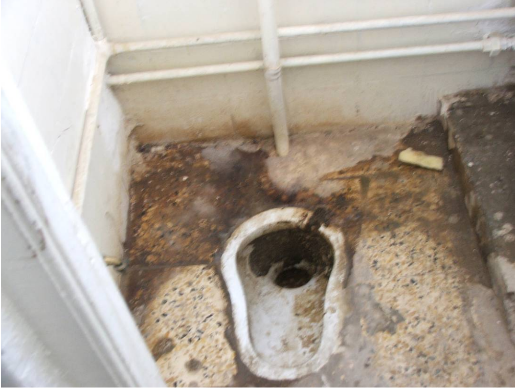
Site Photo 9. Original water closet toilet fixture should have been replaced. The wall should have been tiled and grouted from floor to ceiling and not painted.

The SOW called for a new latrine attached to the guard company building to be comprised of: