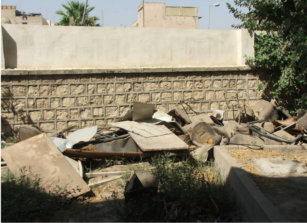
Site Photo 13. Substantial amount of debris on the Police HQ grounds was not removed.