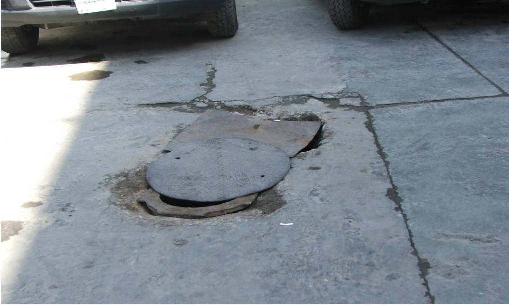
Site Photo 11. Main septic tank was not replaced with one three times the capacity.