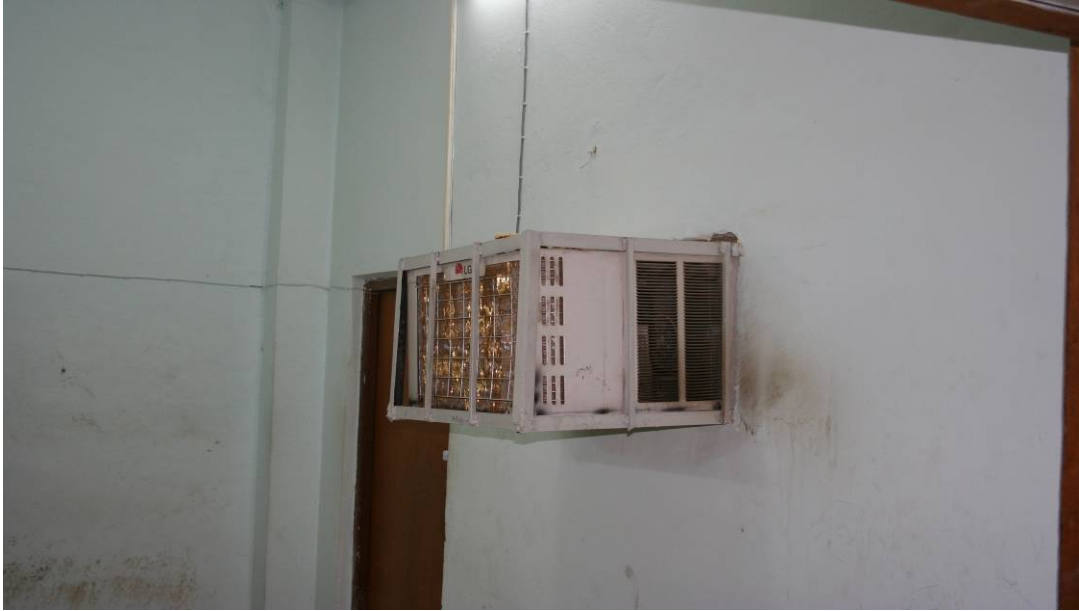
Site Photo 2. This window air conditioner unit should not have been installed in a building interior location because contained units release large amounts of heat into the ambient interior air. The contractor should have installed a more costly split-unit system designed for use in an interior location such as this.