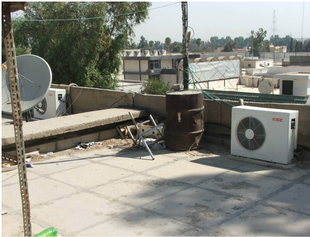
Site Photo 14. All debris was not removed from rooftop.