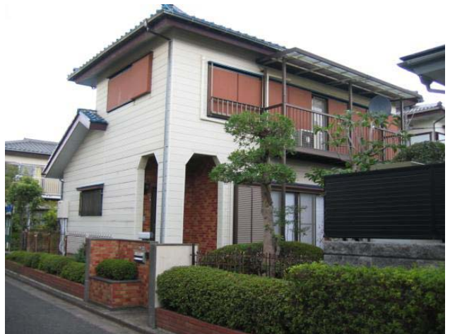
--Example of an off-base house in Mabari Kaigan

For an explanation about dealing with rental agents, up-front costs, and many other details, see websites below: