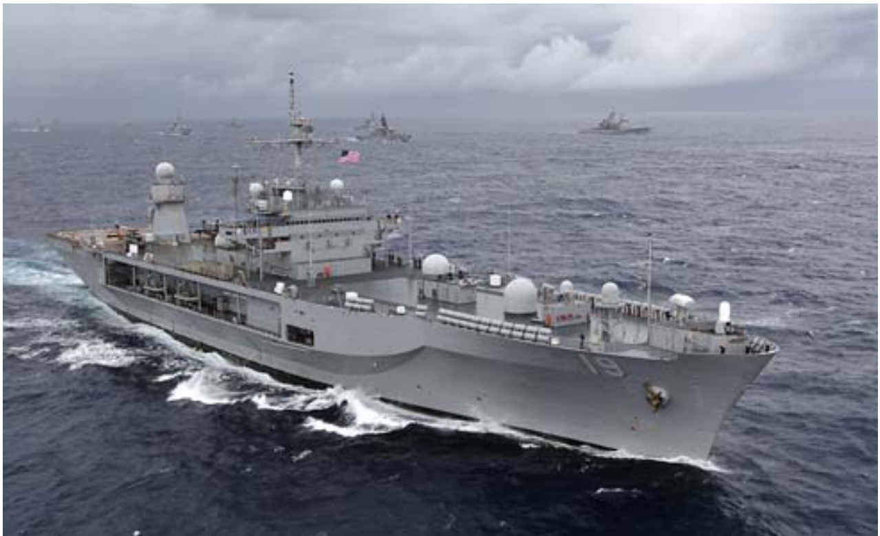
USS BLUE RIDGE (LCC-19)