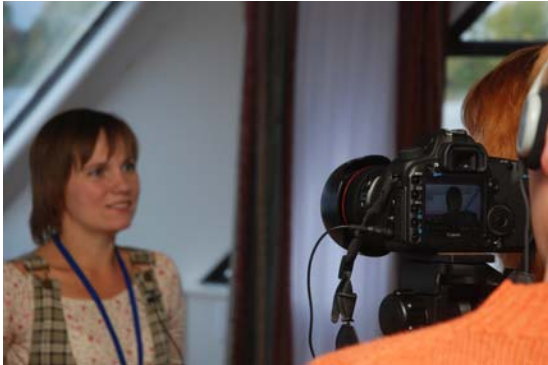
NGOs use media as a tool to inform the public of decisions and policies being considered by their leaders.