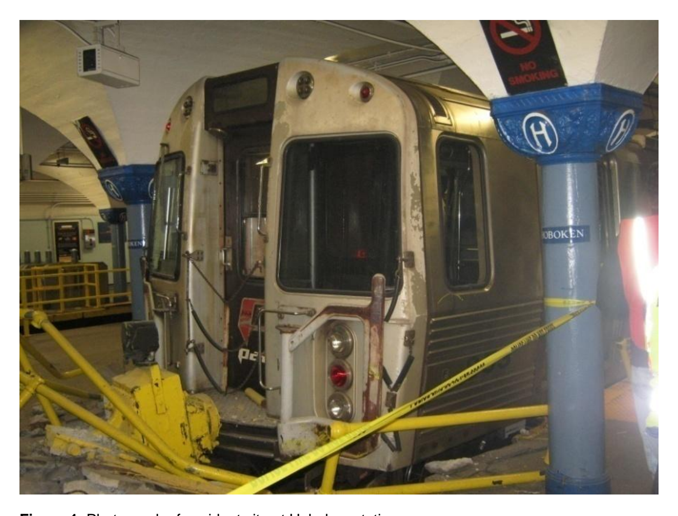
Figure 1. Photograph of accident site at Hoboken station.

PATH train movements are governed by the indications of a signal system, timetable instructions, and operating rules. Train 820 was routed past two signals as the train approached the platform on track 2. Both signals were equipped with mechanical trip stops located on the field (outer) sides of the rails. Postaccident inspection found no problems with the operation of the signal system and no visible indications of strike marks on the trip levers.