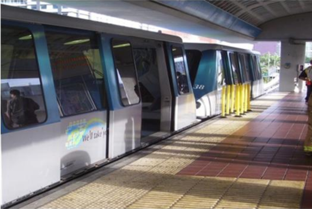
Figure 2. Photograph of Metromover No. 32 (lower left/foreground) and Metromover No. 38 (upper right/ background) at Brickell Station following the accident.

While the NTSB investigation found that Metromover No. 38 struck the trailing end of Metromover No. 32, it also determined that the accident actually resulted from a chain of events concerning two other Metromovers. The following information lists the four Metromovers involved in the investigation and briefly describes the role of each in the events leading up to the accident: