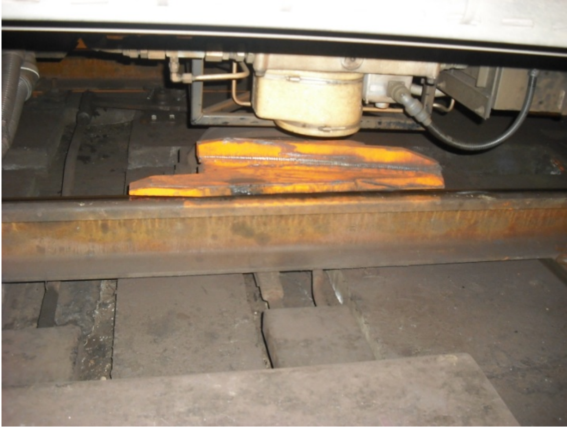
Figure 3. Derail in the normal position for a red signal.