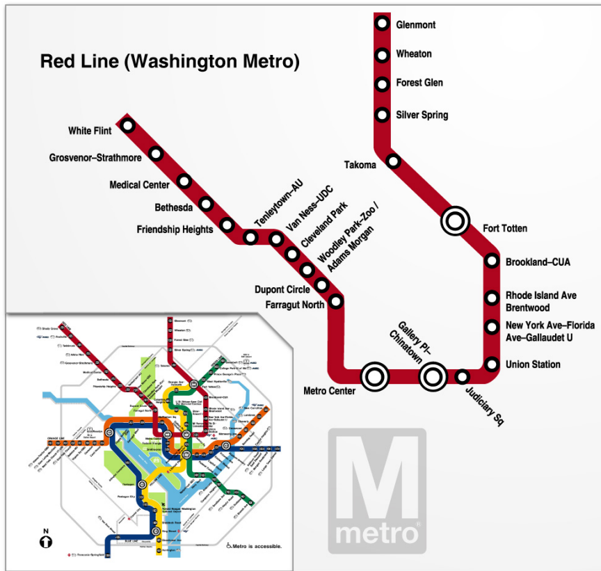
Figure 1. Map of WMATA Red Line. Inset shows entire WMATA system.

On Friday, February 12, 2010, about 9:30 a.m., the operator of train 156 boarded the revenue service train at the Glenmont station. The operator told National Transportation Safety Board (NTSB) investigators that the train had train identification (ID) number 4 641 but did not have a proper destination code, 5 and the Passenger Identification Display 6 indicated “No Passengers.” The train operator reported that she had asked the terminal supervisor for the correct train ID and destination code, but she was instructed instead to move the train with the existing train ID and to use a destination code of “Special.” The train operator complied with these instructions and then received speed commands. 7 The train then departed the Glenmont station on the Red Line No. 2 main track. (See figure 1.)