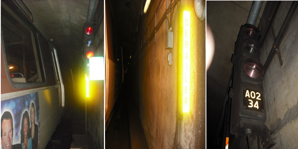
Figure 2. Three views, facing north, of the signal and reflective warning sign for the derail.