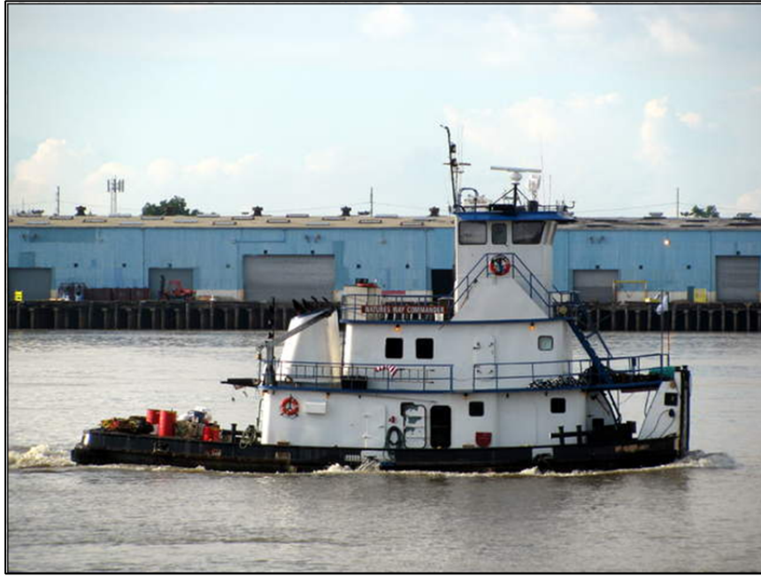
Figure 1. The uninspected towing vessel Natures Way Commander .