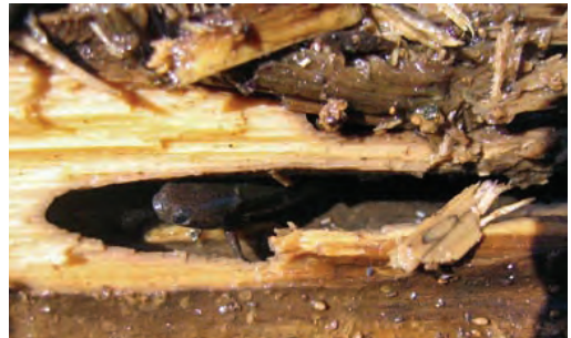
Mangrove rivulus, Rivulus marmoratus , in damp terrestrial habitat where they can breathe air.