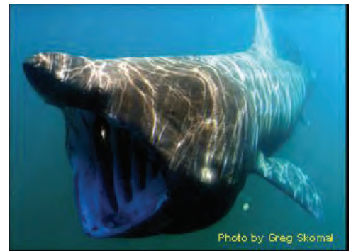
Basking shark, Cetorhinus maximus .

Internal funding of $300,000 was competitively awarded to 11 of the record 26 projects requesting $770,000 that were submitted by Science Centers and Regions. These included projects for pink and pinto abalone restoration, sand tiger shark habitat use, filling data gaps in basking shark knowledge, reproductive studies of bumphead parrotfish and humphead wrasse, genetic evaluation of Hawaiian reef corals, involving volunteers in monitoring river herring status, assessing green sturgeon feeding habitat, and gathering baseline data on age and growth of warsaw grouper and speckled hind. For more information on any of these projects contact the Program Coordinator (see pg. 4).