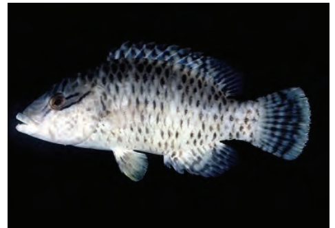
Humphead wrasse, Cheilinus undulatus .

All fact sheets are available for download on the program's website (see pg. 4).