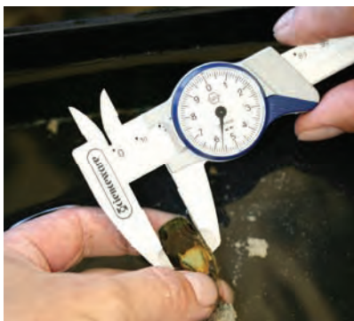
Norton Chan, Aquarist at Waikiki Aquarium, measuring the width of a Lingula . Kelsey Ige, Waikiki Aquarium.