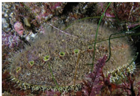
Green abalone, Haliotis fulgens.

Partners have been essential to the accomplishments of the SOC program!