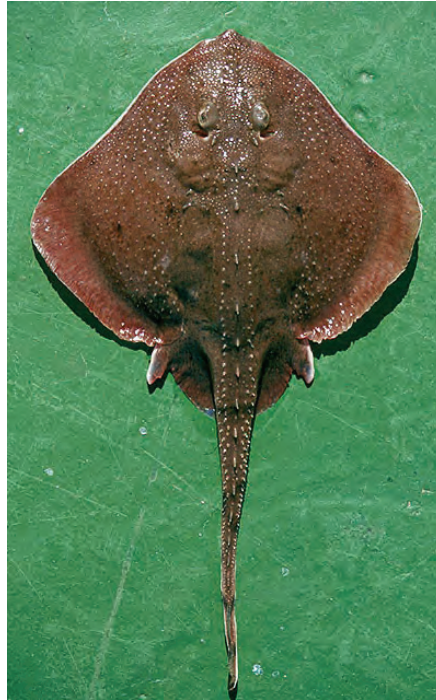
Thorny skate, Amblyraja radiata .

Staff provided training to Regional Fishery Management Council members on the Species of Concern program and SOC species that overlap with those considered by the Councils' to be overfished or undergoing overfishing.