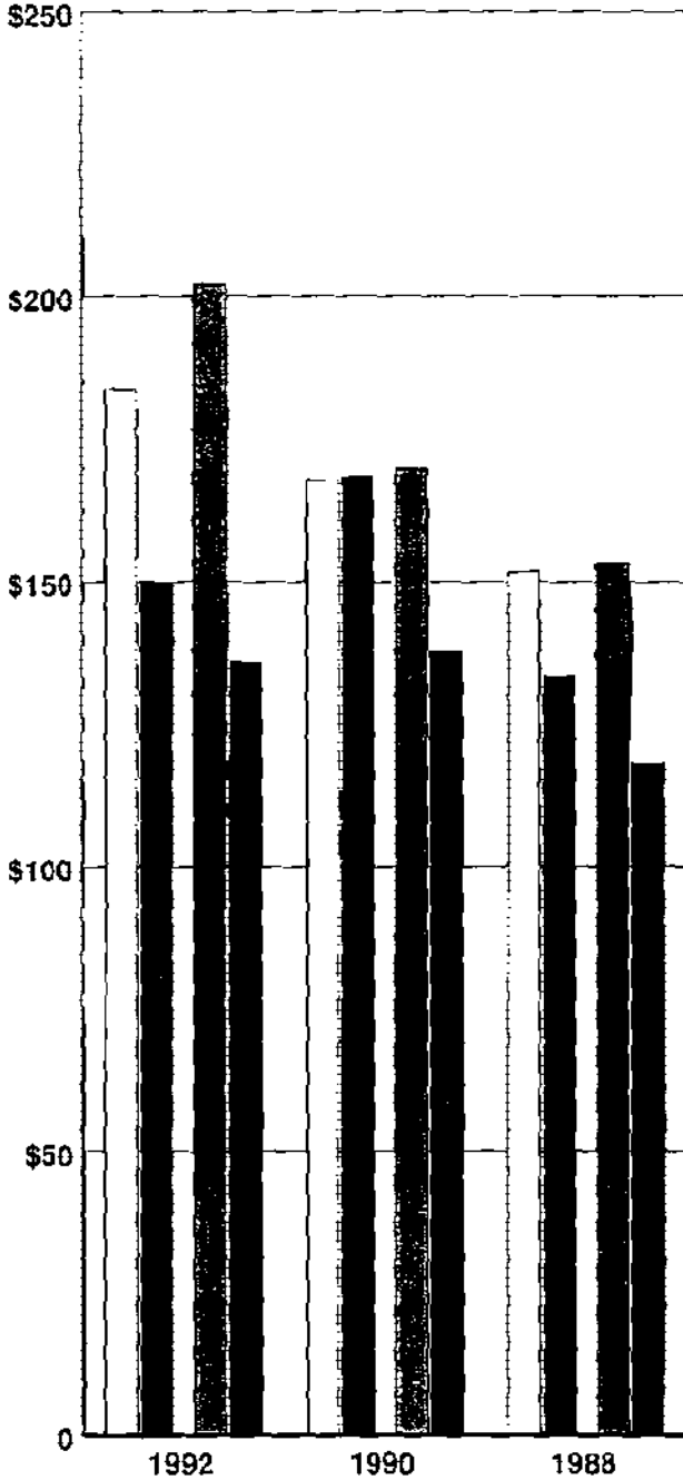
Chart II Challengers 3