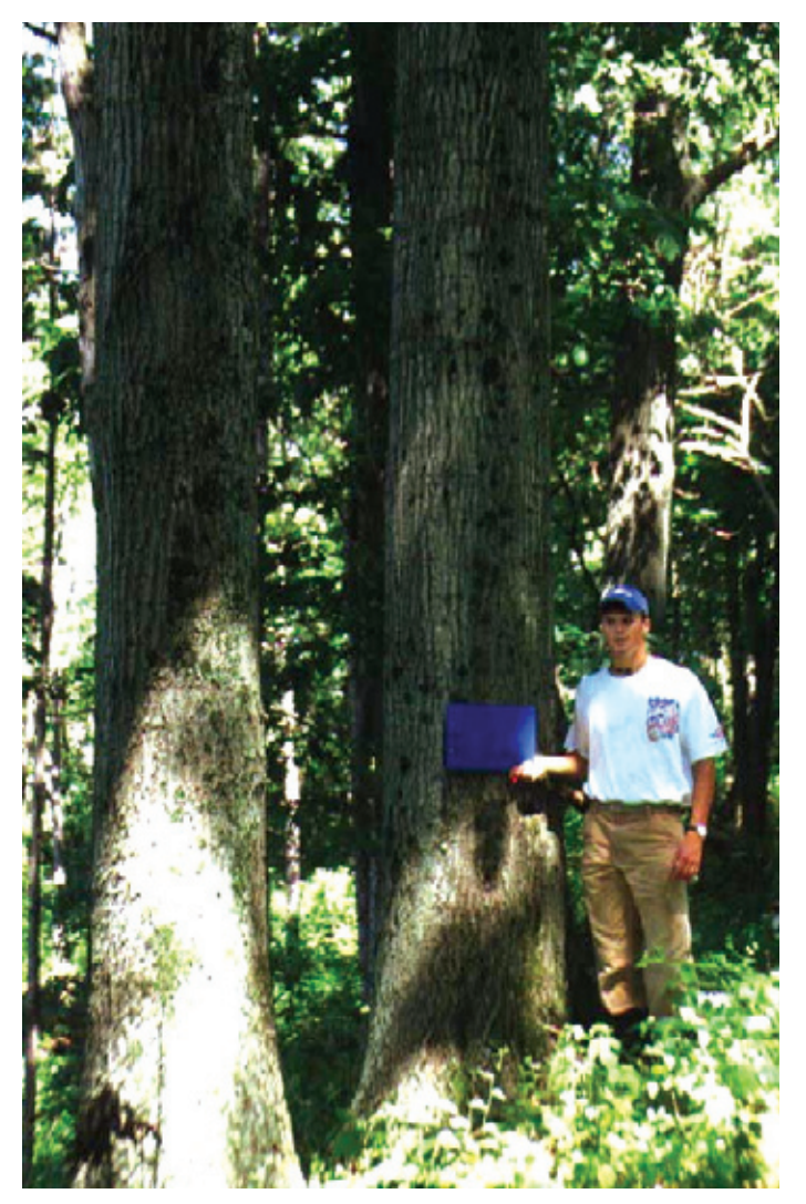
Photo 1. A white oak stand that grew on a pre-SMCRA surface mine in Southern Illinois. Observations by reclamation scientists and practitioners of soil and site conditions on reclaimed mines such as this, where reforestation was successful, have contributed to development of the Forestry Reclamation Approach.

should be placed on the surface to a depth of at least four feet to accommodate the needs of deeply rooted trees.