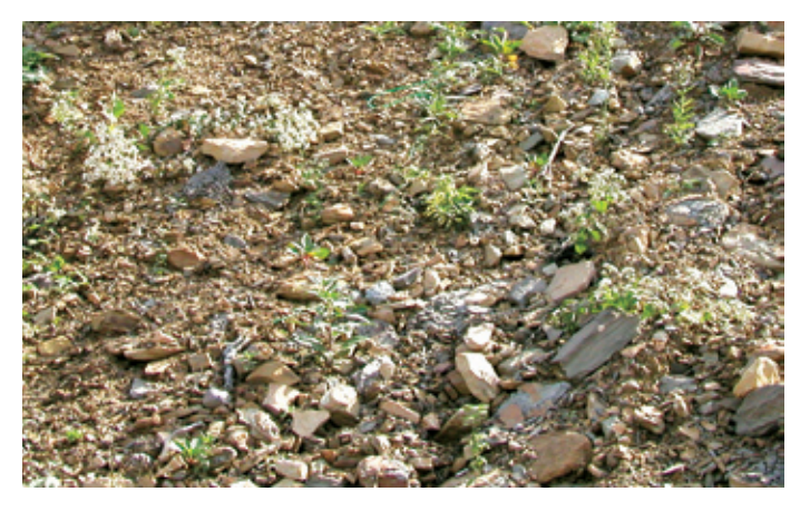
Photo 2. A mixture of brown weathered and gray sandstones , loosely graded to form a soil medium suitable for trees in West Virginia.

Native hardwood diversity and productivity will be best on soils where the pH is between 5 and 7, and such trees generally grow best in soils with loamy textures, especially sandy loams. Such soils can be formed from overburden materials comprised predominantly of weathered brown and/or unweathered gray sandstones, especially if these materials are mixed with natural soils (Photo 2). Use of materials with soluble salt levels lower than 1.0 mmhos/cm on the surface is preferred when such materials are available.