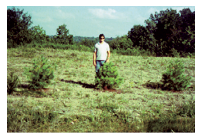
Photo 3. Mine soil properties can have a dramatic effect on tree growth. The Eastern white pines in both photos were the same age (8 years old) when the photos were taken; the pines in the left-hand photo grew on a compacted alkaline shales, while those on the right grew on a moderately acid sandstone.

Ground-cover vegetation used in reforestation reguires a balance between erosion control and competition for the light, water and space required by trees. Ground covers should include grasses and legumes that are slow-growing, have sprawling growth forms, and are tolerant of a wide range of soil conditions. Fast growing and competitive grasses such as Kentucky-31 tall fescue and aggressive legumes such as sericea lespedeza and crown vetch should not be used where trees will be planted. Slower-growing grasses such as red top and perennial ryegrass, and legumes such as birdsfoot trefoil and white clover, when used in a mix with other appropriate species will increase seedling survival while controlling erosion over the longer term as the trees and accompanying vegetation mature to form a forest. Fertilizer rates should be low in nitrogen, relative to rates commonly used to establish pastures, so as to discourage heavy ground cover growth while applying sufficient rates of phosphorus and potassium for optimal tree growth.