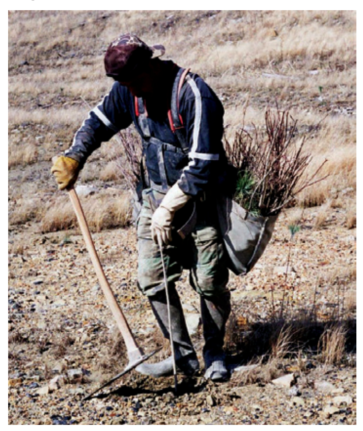
Photo 5. Planting a seedling at the White Oak reforestation project in Tennessee. Because the soil has not been compacted, a planting hole of the correct depth for the seedling can be opened easily. The seedling is being planted while still dormant, during the late winter season.

Selection of surface materials with chemical and physical properties suitable for trees and successful establishment of less-competitive groundcovers will increase survival of planted seedlings while allowing for invasion by native tree species from the surrounding forest. Avoidance of soil compaction will make it easier for tree planters to plant seedlings firmly and at the proper depth, thereby increasing survival rates.