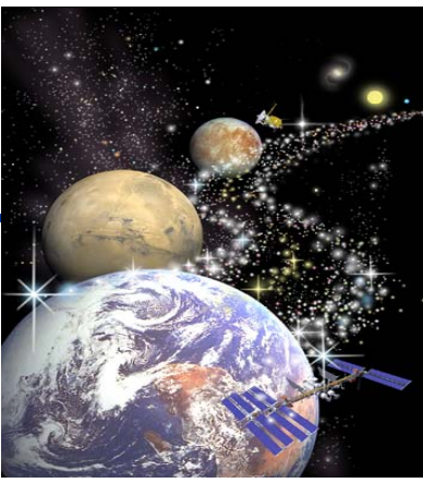
Stairway to the Stars