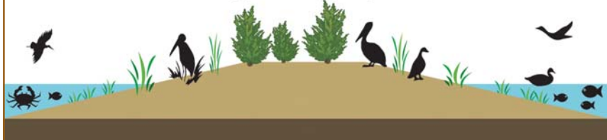
Adapted from CWRPRA Project TV-18 monitoring plan