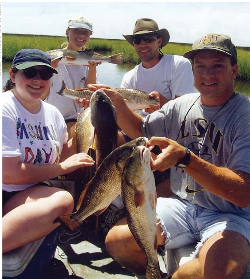
Above: The world-renowned recreational fisheries of coastal Louisiana depend on the state's wetlands, which provide food, shelter and nursery habitat to popular game fish like red drum.