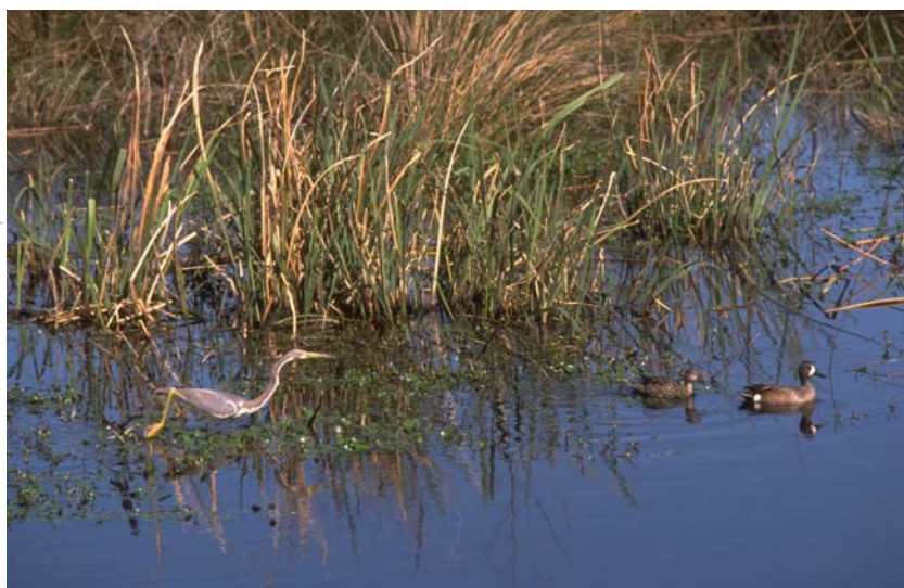
As young fish increase in size, they become less vulnerable to other fish, but more so to birds. At this stage they tend to migrate from their shallow marsh-edge habitats to deeper water.