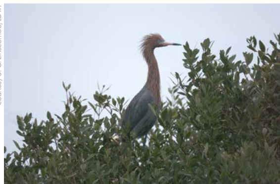
Black mangroves planted atop the dunes of Raccoon Island provide nesting habitat for several species of herons and egrets, including the reddish egret (above). The woody shrubs provide nesting cover and resting perches for native and migrating birds.