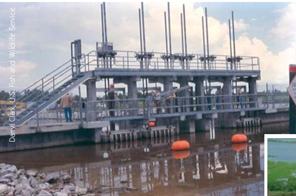
Right: Straddling a small waterway that connects the Sabine National Wildlife Refuge to Calcasieu Lake, the Hog Island Gully water control structure helps protect over 42,000 acres of marsh from high-salinity salt water.

Water can now move in and out of the refuge in a way that mimics tidal flow, Clark says. “That preserves marsh habitat, fish and wildlife for the enjoyment of duck hunters, bird watchers and the thousands of others who fish, crab and shrimp here every year.” WM