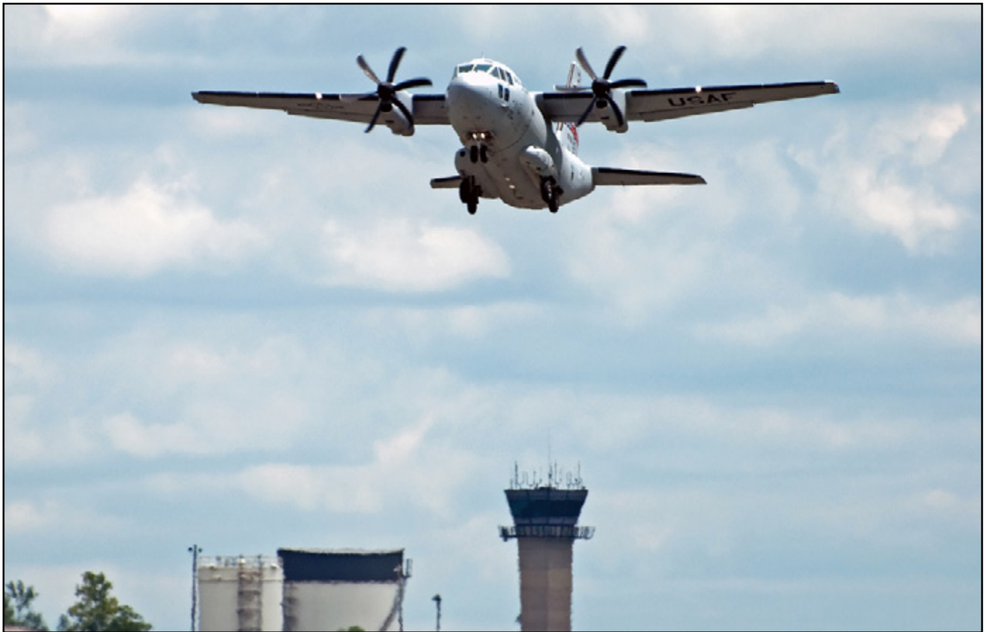
The 179th Airlift Wing's C-27J Spartan