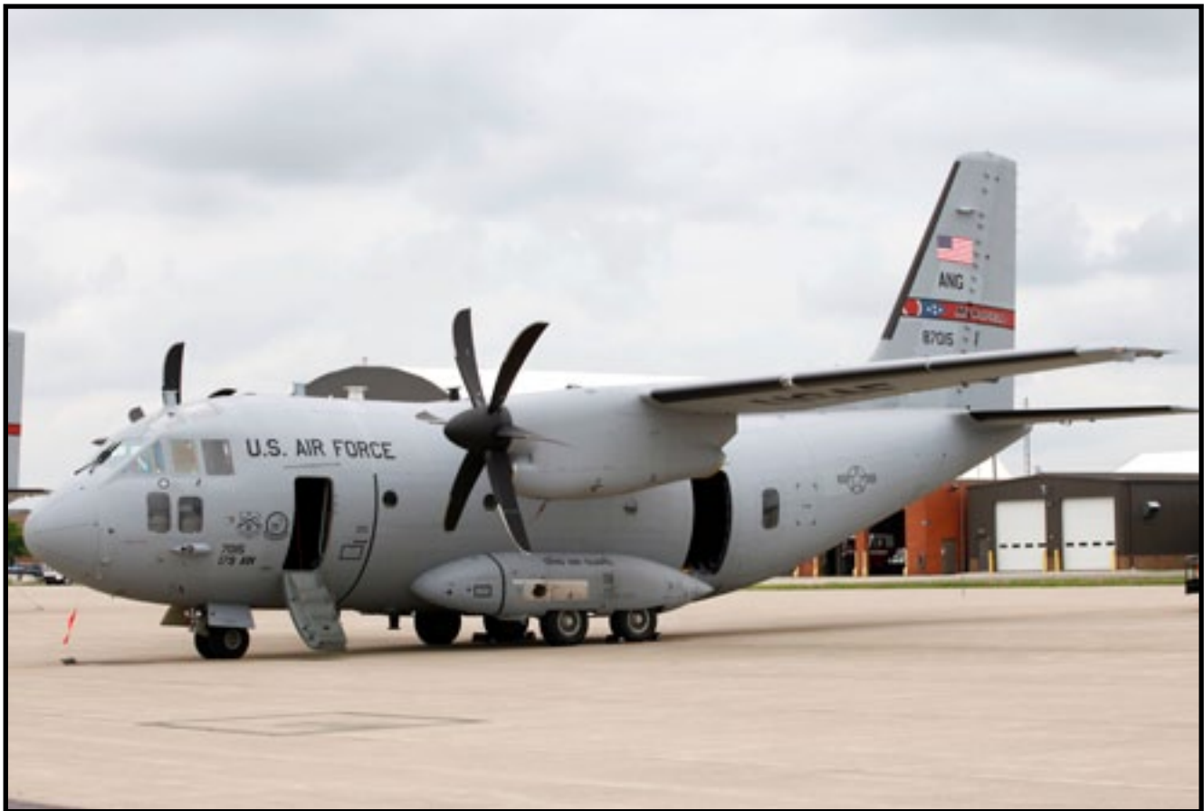
The 179th Airlift Wing's C-27 J Spartan receives new aircraft markings distinguishing its belonging to Mansfield's unit.