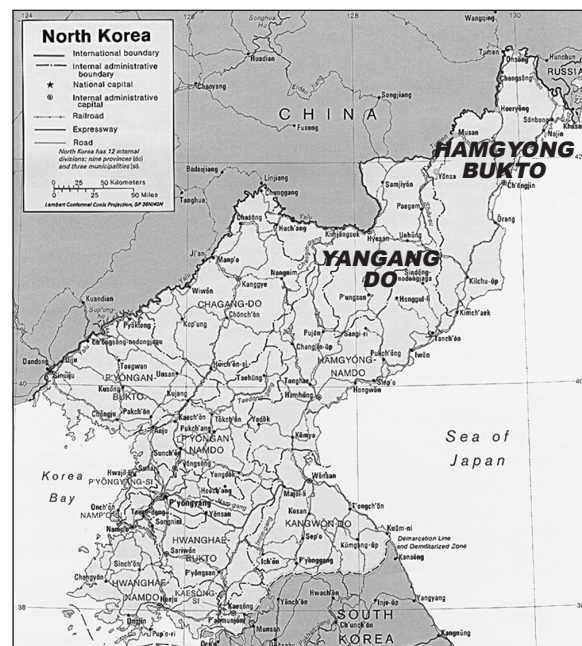
Alleged opium farms.

North Korea has ties with global crime syndicates such as Chinese triads and Japanese yakuza. Japanese sources believe the North Koreans have linked up with the yakuza to transfer drugs at sea off Japan's long coastline. Some Japanese sources believe half the drugs imported into Japan originate