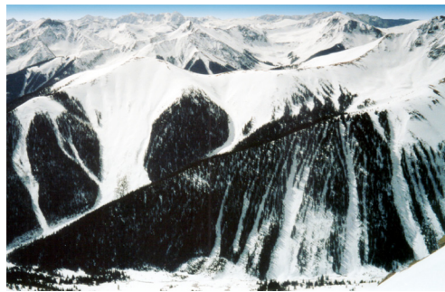
Above: San Juan Mountains, Colorado – a prominent contributor of snowmelt runoff to the Colorado River. Right: Snow Cover maps will be coordinated with mountain weather stations for integrated operational hydrologic forecasting.

GOES-R snow products will be indispensable to the climate community. Our climate is highly dependent upon the location, extent, and timing of the annual cycle of snow accumulation, persistence, and depletion. The ebb and flow of continental climate conditions is influenced by snow's high albedo and low thermal conductivity.