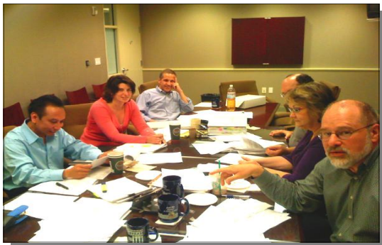
Section 202/811 Team

During Fiscal Year 2006, HUD endorsed 68 assisted living/board & care facilities and 156 nursing homes. This was 24% of the loans endorsed under basic FHA programs.