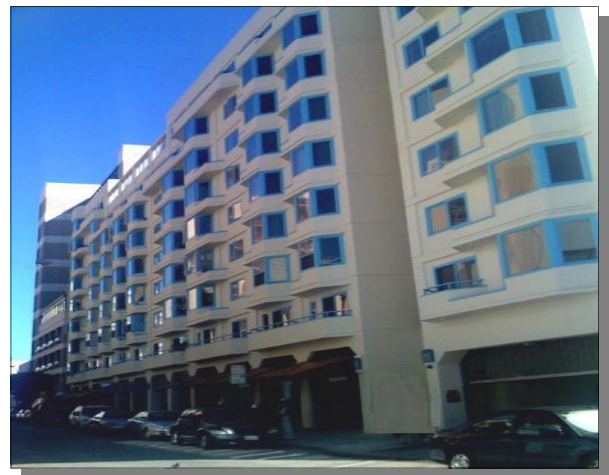
Ceatrice Polite Apartment

The nine story facility was developed by TODCO (Tenants and Owners Development Corporation) Group. This project was initially built in 1983 with HUD's Section 202 Direct Loan funding. The project has a Section 8 project-based HAP contract for all 91 units. In 2006, through Red Mortgage Capital, new HUD/FHA Section 221(d)(4) mortgage insurance was utilized, in conjunction with tax exempt bonds and Low Income Housing Tax Credits to rehabilitate the facility. The scope of work included new roofing, alarm system, laundry equipment, carpeting, kitchens, bathroom upgrades, accessibility improvements and refurbishment of the elevators.