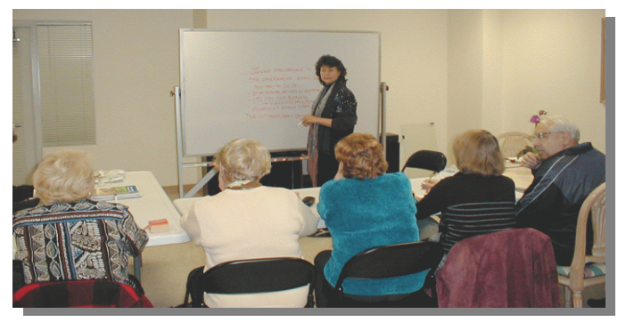
ESL classes at Steamboat Apartments, San Francisco