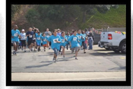
2011 HARS awardees with Housing Commissioners & CDC/HACoLA staff