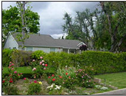
White Oak Group Home

Northridge neighborhood of the Valley. This facility looks like any other single family home on this quiet residential street and provides housing for 3 wholly developmental disabled persons under Section 811.