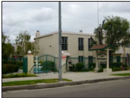
Fountain Park Cooperative

First we go to Fountain Park Cooperative which is a non-subsidized complex incorporated as a cooperative jointly owned by 221 shareholders. A cooperative differs from a condominium in that the shareholders hold a share of stock in the total building(s) and land, and each share carries with it a right to occupy a specific unit. Fountain Park is located in the Woodlands Hills neighborhood of the Valley in a beautiful residential area that is also close to shopping and public transportation. There are 20 one-bedroom, 191