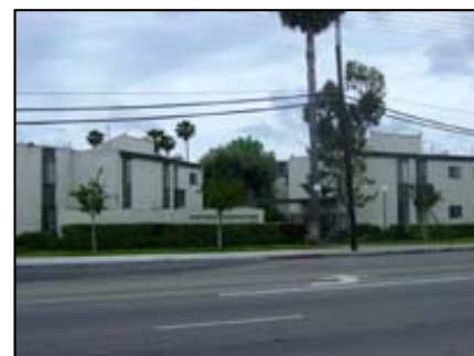
Parthenia Townhomes in the Canoga Park

Next we go to Parthenia Townhomes in the Canoga Park neighborhood of the Valley. This complex for families has 16 two-bedroom, and 8 three-bedroom apartments. It's owned and managed by G & K. It has a HUD insured mortgage under Section 221(d)(3) as well as an equity 241 housing preservation loan. The project received a 99a score on its REAC physical inspection in 2002.