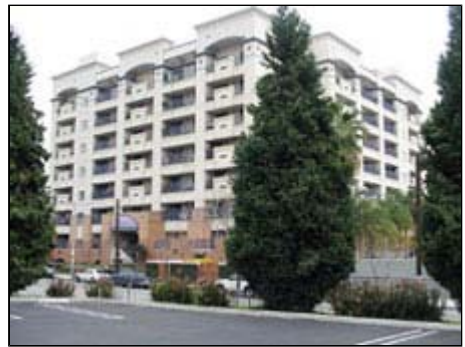
Hollywood Silvercrest Residence