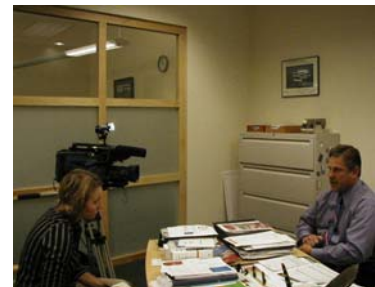
KCWY television interview