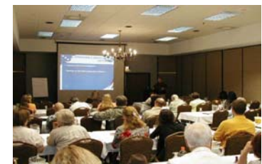
Grant writing Workshop