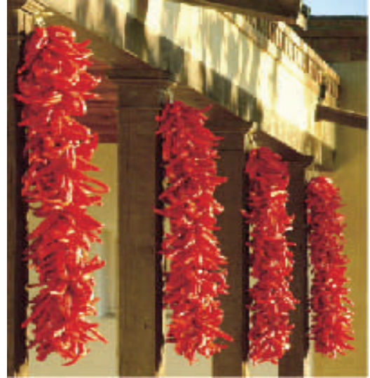
New Mexico Chile Ristras, a Northern New Mexico tradition

Los Alamos National Laboratory (LANL) was a proud supporter of this year's New Mexico Minority Business Week (MED Week) awards celebration, which was held in September at the Hotel Albuquerque in Albuquerque, New Mexico. Thirty-three organizations were co-sponsors, including federal agencies and prime contractors providing an excellent opportunity to network with other minority businesses, and government buyers. LANL procurement staff attended the event and were available to communicate the various business opportunities to those interested in doing business with the Laboratory.