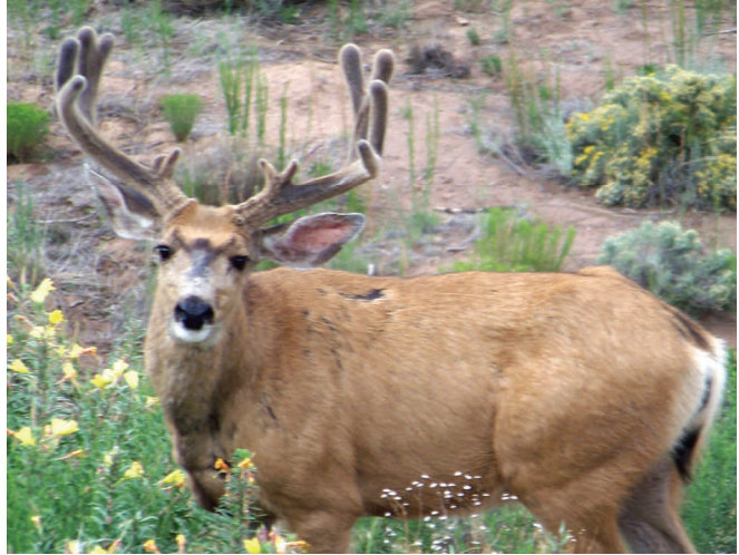
Photo of a mule deer in Los Alamos, N. M.