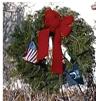
One of many Christmas wreaths dedicated to American soldiers at the Santa Fe National Cemetery.

agencies included the American Indian Chamber of Commerce of New Mexico, the Energy Technology and Environmental Business Association, New Mexico 8(a) and Minority Business Association, Sandia National Laboratories, and others.