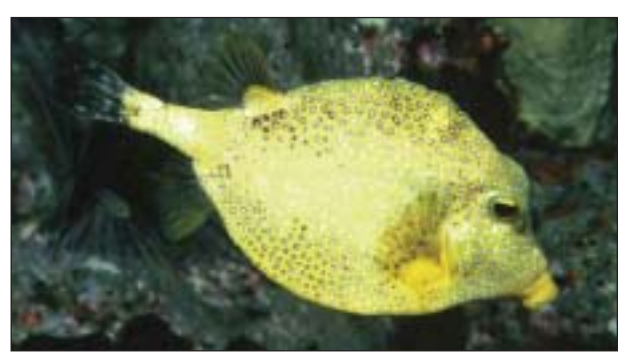
Figure 209. The golden-phase smooth trunk fish has only been reported on the Flower Gardens and Stetson Bank reefs.

nent reef fish population. Fish diversity is low compared with other Caribbean and South Atlantic reefs (266 species) and abundance is high (Pattengill-Semmens 1999). Based on abundance, planktivores and invertebrate feeders are the most dominant trophic groups (Pattengill et al. 1997).