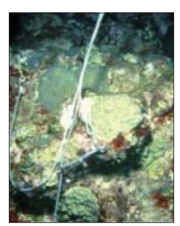
Figure 212. Hook-and-line fishing gear snagged on a coral.

The two primary groups using reef resources are fishers and SCUBA divers. Recreational hook-and-line fishers frequently use the area. Commercial snapper and grouper long-line fishers fish along the edges of the banks and sometimes illegally within the borders, or lose gear