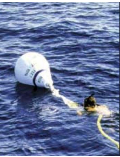
Figure 215. Mooring buoys have been installed at FGBNMS to prevent anchor damage to corals.

and water circulation information. It also should be expanded to include specific studies on algae population dynamics, the incidence and etiology of coral disease, and the area of the coral reef community in the deeper parts of the Sanctuary. The frequency of the monitoring program should also be increased to capture the aspects of community ecology that undergo short-term and seasonal