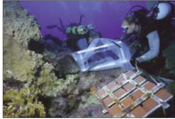
Figure 214. Researchers from the University of Texas lay tiles out on a reef during a study of coral spawning (Photo credit: Ed Enns).

MPAs – The Flower Garden Banks were designated as a National Marine Sanctuary in January 1992, and are administered by NOAA. In cooperation with appropriate partners, the Sanctuary staff directs resource protection, education, research, and enforcement efforts. MMS provides additional protection through requirements imposed on industry operators in what is known as the 'Topographic Features Stipulation' for the Sanctuary.