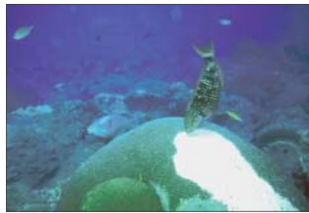
Figure 208. A stoplight parrotfish at the East Flower Garden Bank.

spin-off eddies. Close to shore there is a counterclockwise (east to west) shelf current off western Louisiana and Texas. This current is strongest in