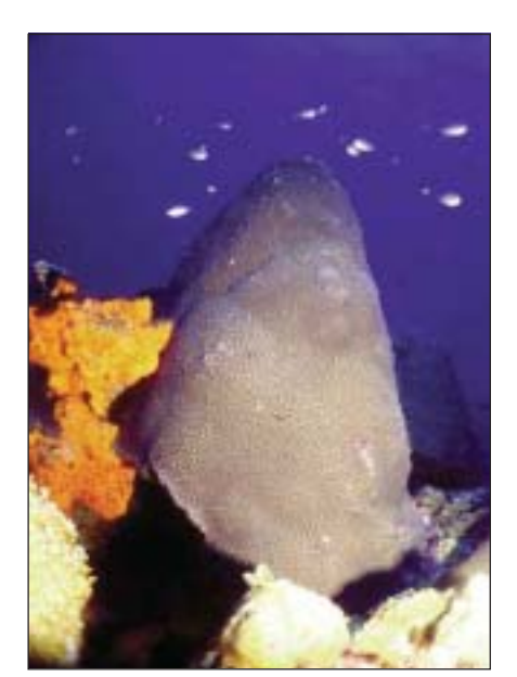
Figure 206. Reefs at the Flower Garden Banks have high coral cover.

Atlantic and are among the few reefs anywhere that can be considered nearly pristine (Gittings and Hickerson 1998). The ocean water bathing the reefs is clear with visibility usually 25-30 m. Salinity and temperature variations are well within the range required for active coral growth. When first studied in the early 1970s, coral communities in the Flower Garden Banks appeared stable and in excellent general health and have remained so. Some isolated injury caused by anchoring vessels, illegal fishing gear, tow cables, and seismic arrays was observed.