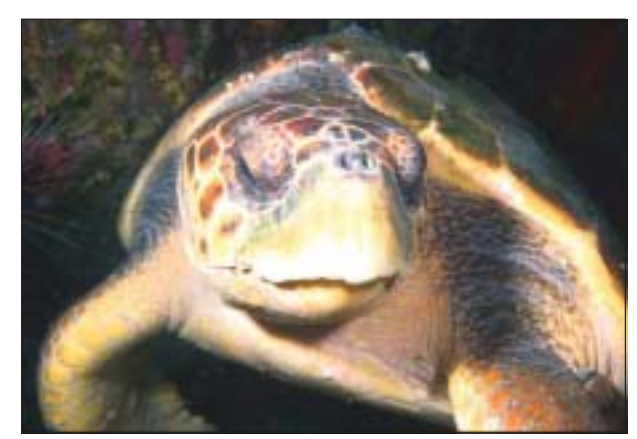
Figure 211. A loggerhead turtle.

Over the last 20 years, a number of large industry vessels, freighters, and fishing vessels have anchored at the Flower Garden Banks and caused significant damage (Gittings et al. 1992). Since 1994 there have been at least three large vesselanchoring incidents. Foreign-flagged cargo vessels have occasionally anchored, unaware of the anchoring restrictions.