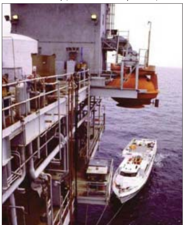
Figure 213. The High Island 389A gas production platform within the Sanctuary.

The two primary groups using reef resources are fishers and SCUBA divers. Recreational hook-and-line fishers frequently use the area. Commercial snapper and grouper long-line fishers fish along the edges of the banks and sometimes illegally within the borders, or lose gear