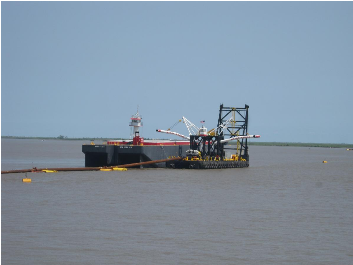
Spider barge – July 10, 2010

Prepared by: Shaw's Environmental & Infrastructure Group