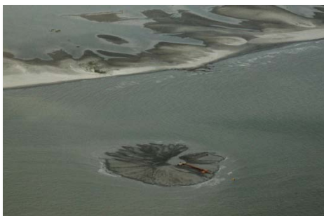
E4 South Berm – August 26, 2010

*Under Construction represents linear footage of berm placed; all material may not yet conform to elevation +6.