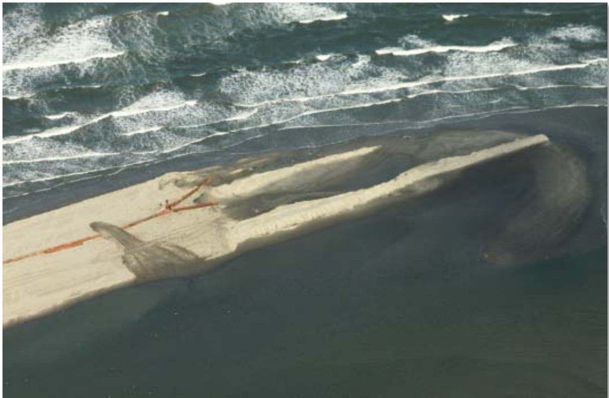
E4 North Berm Construction – August 31, 2010

Shaw Environmental & Infrastructure Group