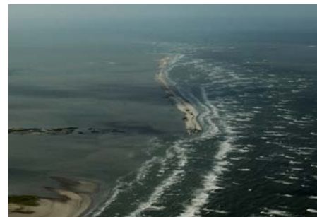
E4 North Berm – August 31, 2010