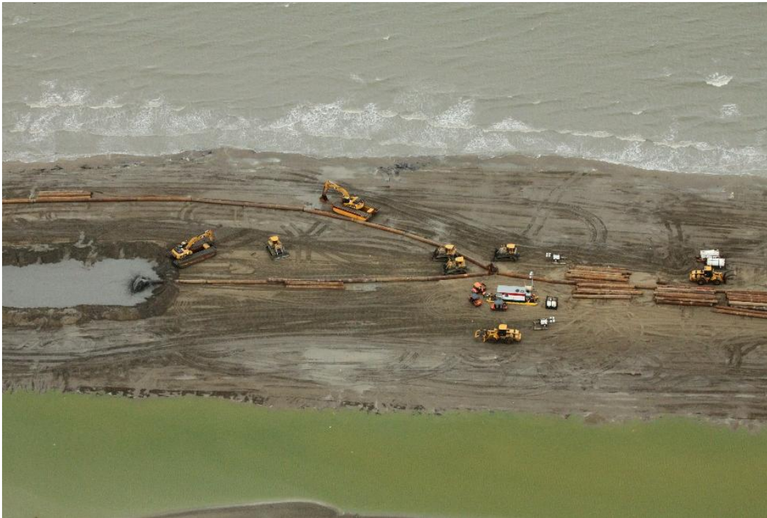
W9 Berm Construction – August 26, 2010

Shaw Environmental & Infrastructure Group