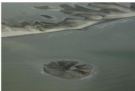
E4 South Berm – August 26, 2010

*Under Construction represents linear footage of berm placed; all material may not yet conform to elevation +6.