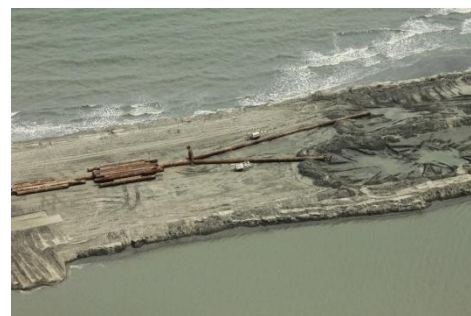
E4 North Berm Construction – August 26, 2010