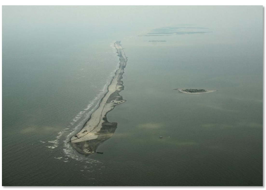
E4 North Berm – August 26, 2010

Shaw Environmental & Infrastructure Group