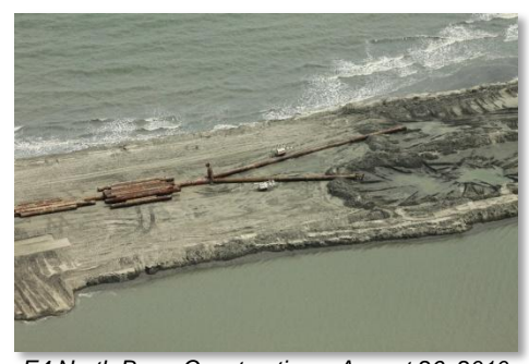
E4 North Berm Construction – August 26, 2010