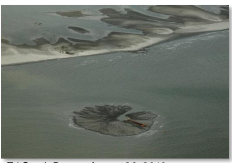
E4 South Berm – August 26, 2010

Note: Data subject to one day lag. Under normal field conditions, berm is advancing approximately 500 LF per reach per day. *Under Construction represents linear footage of berm placed; all material may not yet conform to elevation +6.