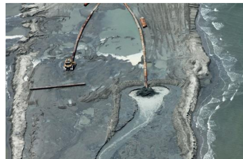
E4 North Berm Construction – August 24, 2010