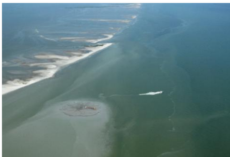
E4 South Berm – August 24, 2010

*Under Construction represents linear footage of berm placed; all material may not yet conform to elevation +6.