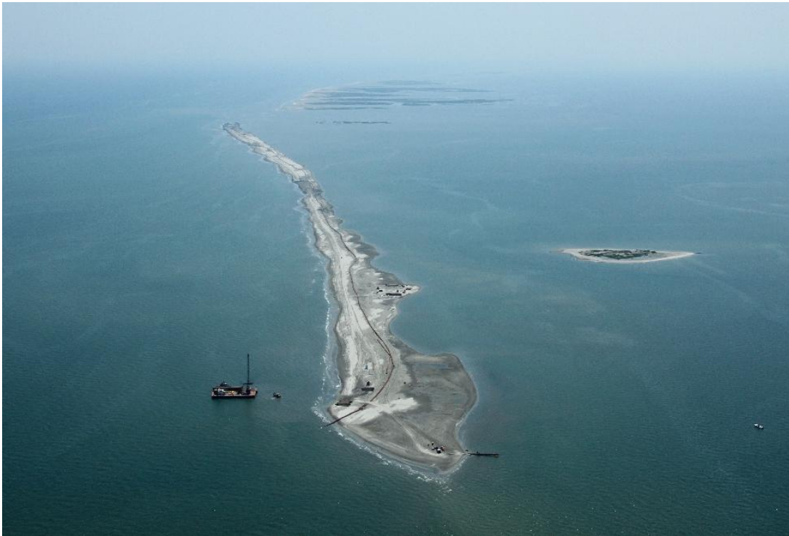
E4 North Berm – August 24, 2010

Prepared by: Shaw Environmental & Infrastructure Group