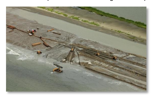
W9 Berm - August 20, 2010

Note: Data subject to one day lag. Under normal field conditions, berm is advancing approximately 500 LF per reach per day. *Under Construction represents linear footage of berm placed; all material may not yet conform to elevation +6.