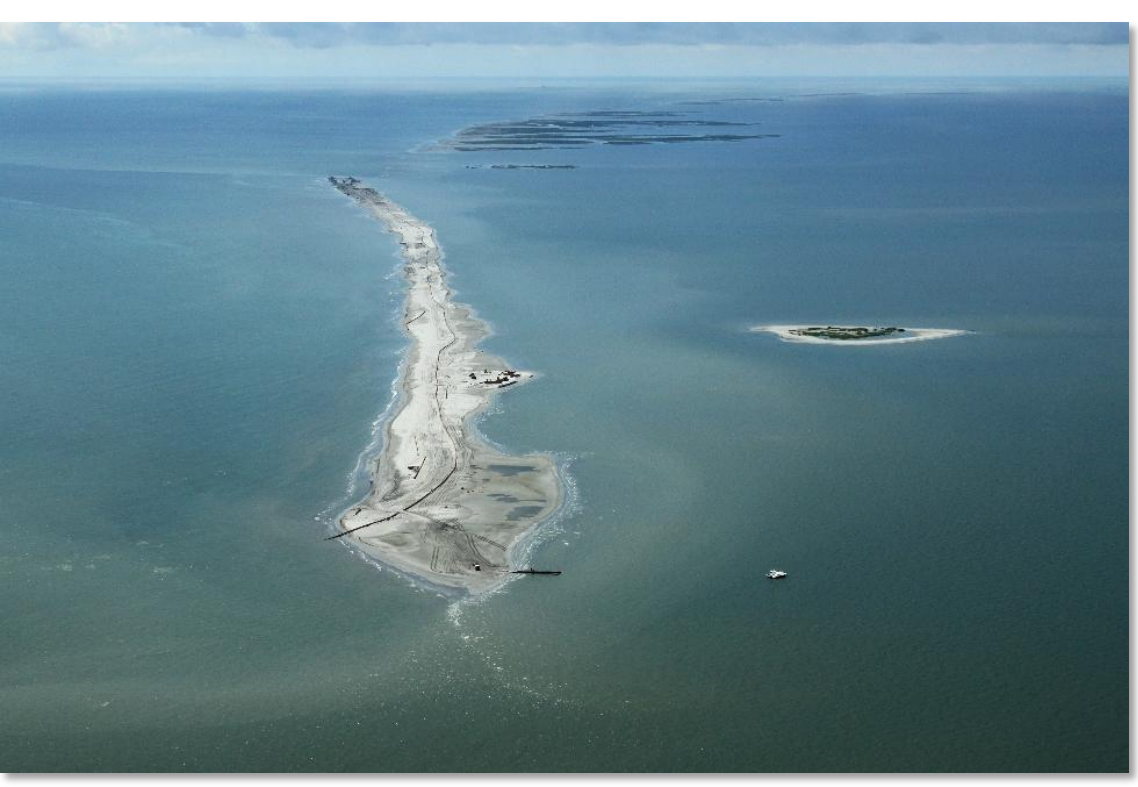
E4 North Berm - August 22, 2010

Shaw Environmental & Infrastructure Group