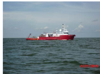
Geodetic Surveyor at 25-5 – August 21, 2010