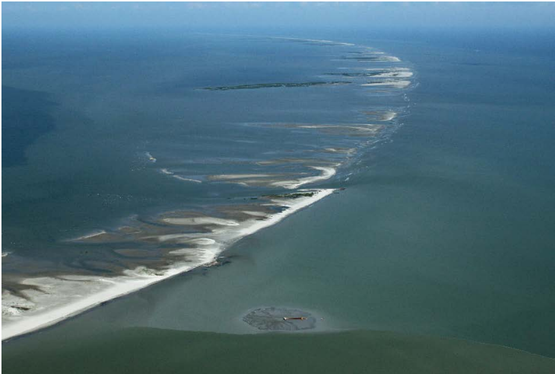
E4 South Berm – August 22, 2010

Shaw Environmental & Infrastructure Group