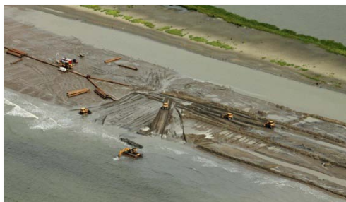
W9 Berm – August 20, 2010

*Under Construction represents linear footage of berm placed; all material may not yet conform to elevation +6.