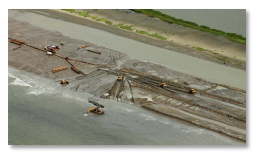
W9 Berm – August 20, 2010

Note: Data subject to one day lag. Under normal field conditions, berm is advancing approximately 500 LF per reach per day. *Under Construction represents linear footage of berm placed; all material may not yet conform to elevation +6.