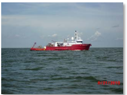
Geodetic Surveyor at 25-5 – August 21, 2010