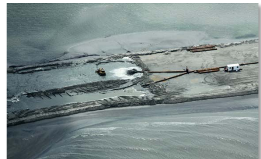
E4 North Berm – August 18, 2010