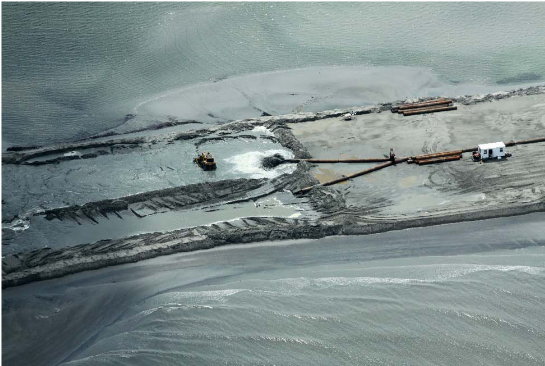
E4 North Berm Operations – August 18, 2010

Shaw Environmental & Infrastructure Group