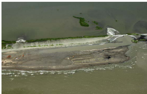
W9 Berm – August 18, 2010

*Under Construction represents linear footage of berm placed; all material may not yet conform to elevation +6.