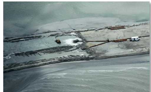
E4 North Berm – August 18, 2010