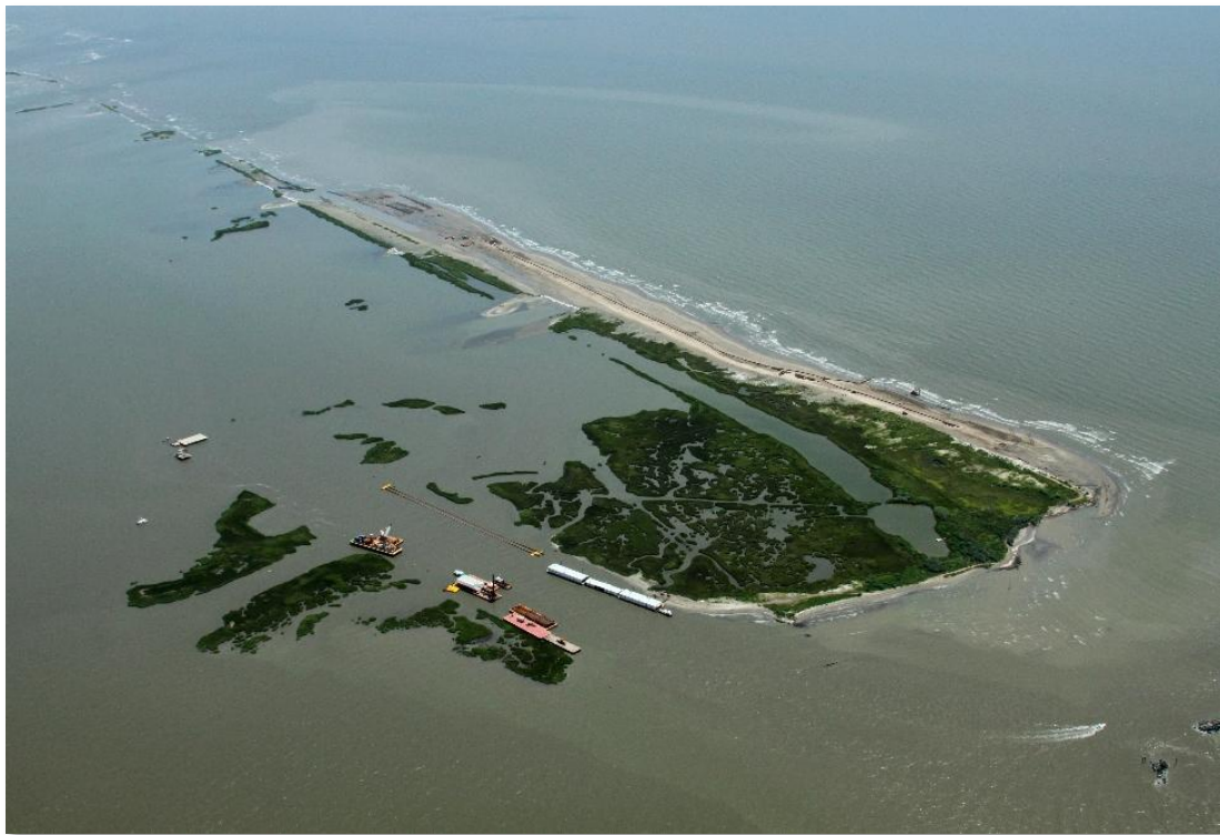
W9 Berm – August 18, 2010

Shaw Environmental & Infrastructure Group