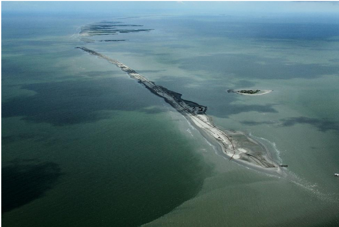
E4 North Berm – August 18, 2010

Shaw Environmental & Infrastructure Group