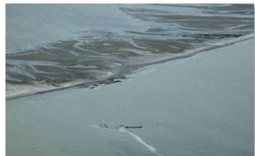
E4 South Berm – August 15, 2010