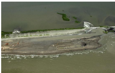
W9 Berm – August 18, 2010

*Under Construction represents linear footage of berm placed; all material may not yet conform to elevation +6.