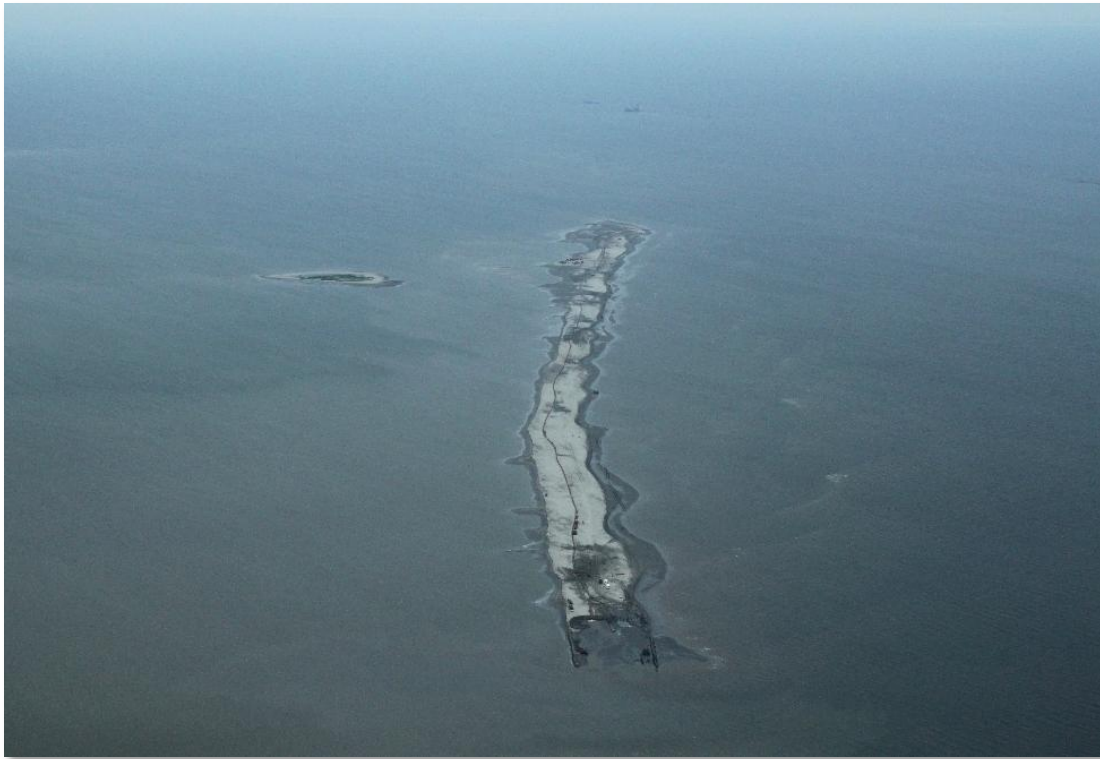
E4 North Berm – August 15, 2010

Shaw Environmental & Infrastructure Group