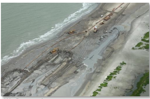
W9 Berm - August 15, 2010

Note: Data subject to one day lag. Under normal field conditions, berm is advancing approximately 500 LF per reach per day. *Under Construction represents linear footage of berm placed; all material may not yet conform to elevation +6.