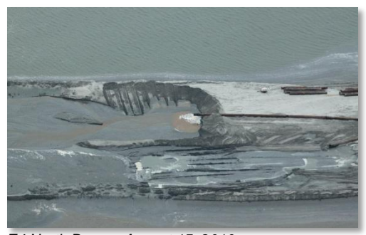
E4 North Berm - August 15, 2010