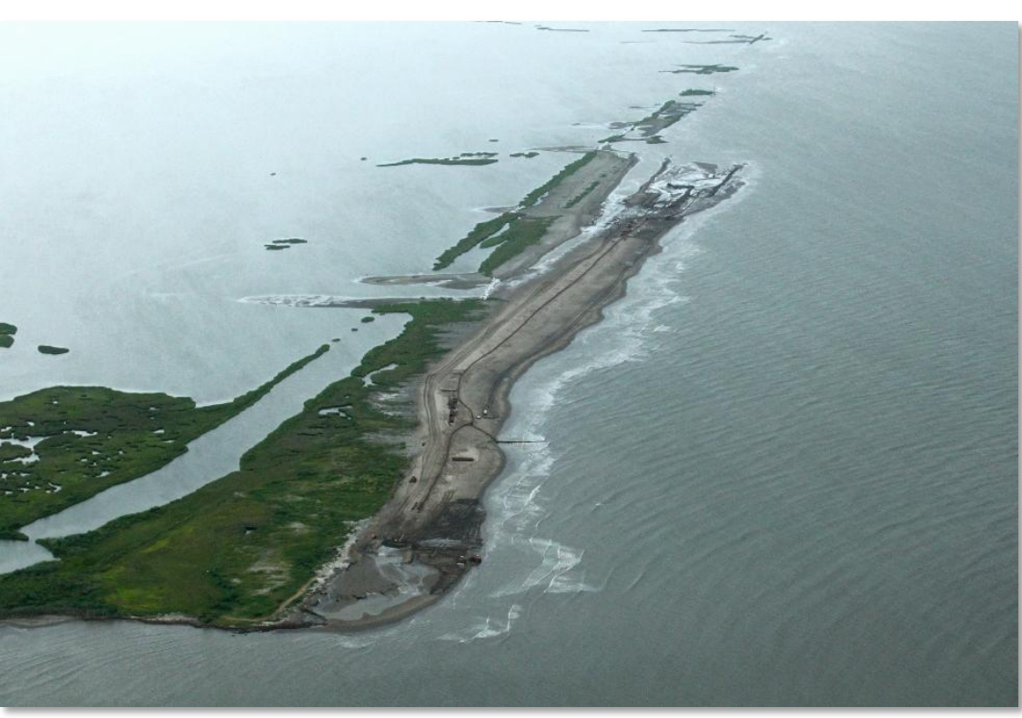
W9 Berm - August 15, 2010

Shaw Environmental & Infrastructure Group