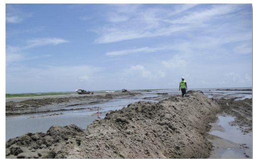
W9 Berm – August 14, 2010