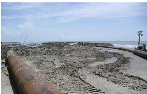
W9 Berm Construction – August 14, 2010

*Under Construction represents linear footage of berm placed; all material may not yet conform to elevation +6.