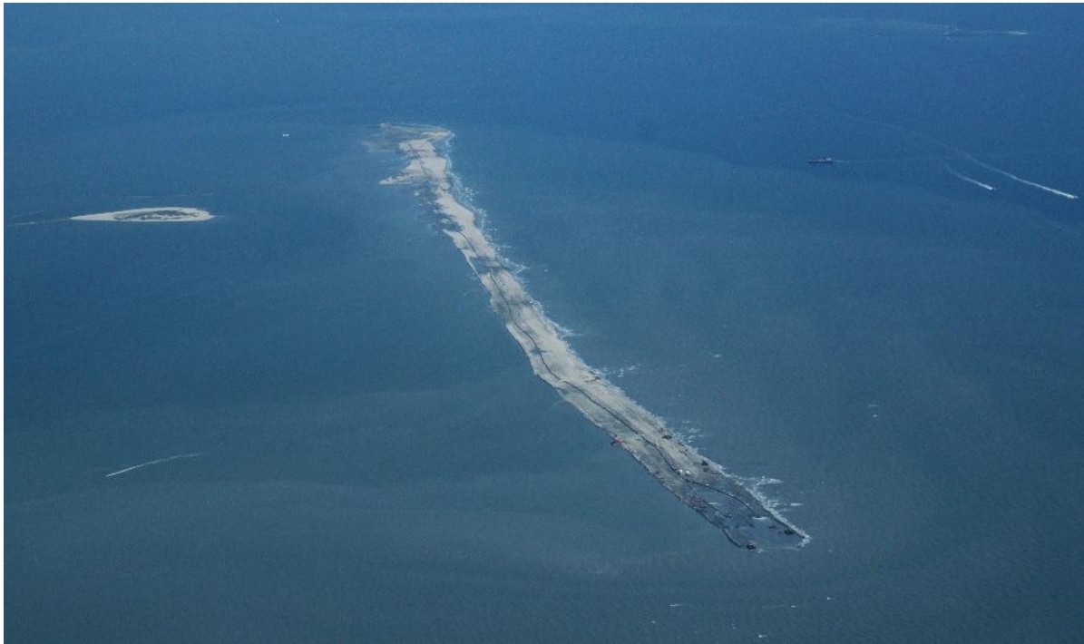
E4 Berm – August 10, 2010

Shaw Environmental & Infrastructure Group