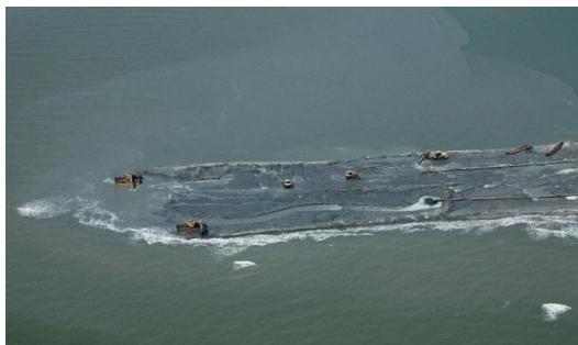
E4 Berm Construction – August 10, 2010

*Under Construction represents linear footage of berm placed; all material may not yet conform to elevation +6.