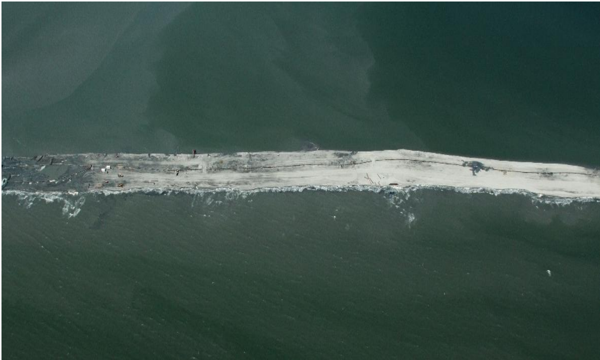
E4 Berm – August 10, 2010

Prepared by: Shaw Environmental & Infrastructure Group