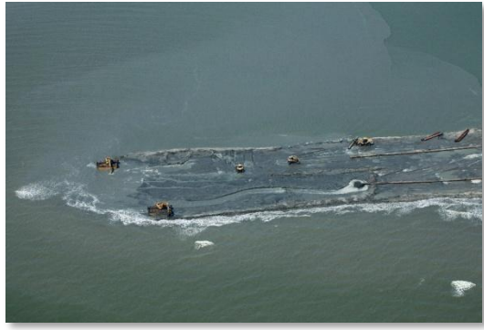
E4 Berm Construction - August 10, 2010