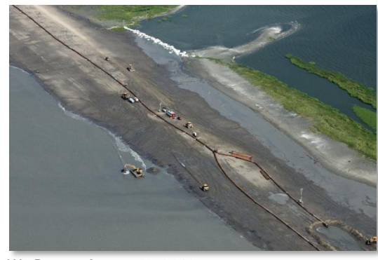
W9 Berm - August 10, 2010