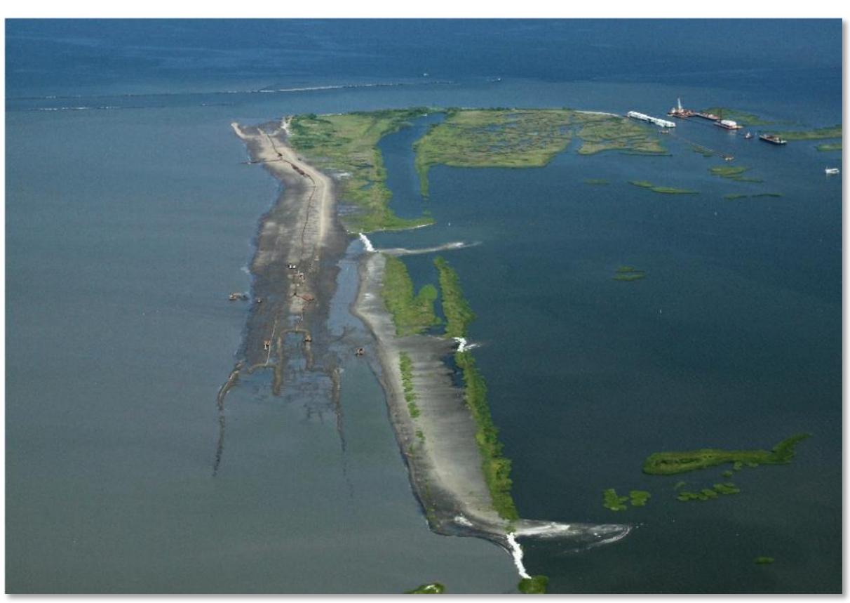
W9 Berm - August 10, 2010

Shaw Environmental & Infrastructure Group