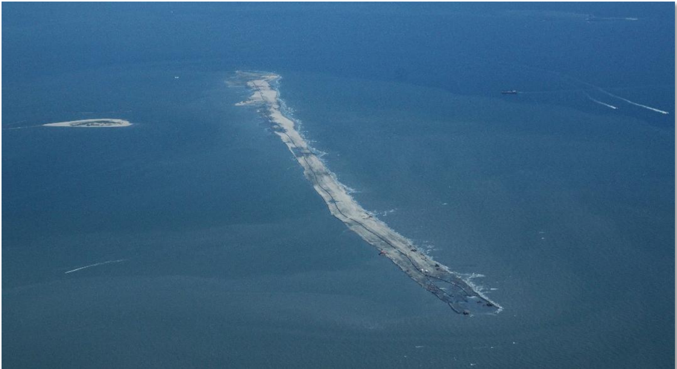
E4 Berm – August 10, 2010

Shaw Environmental & Infrastructure Group