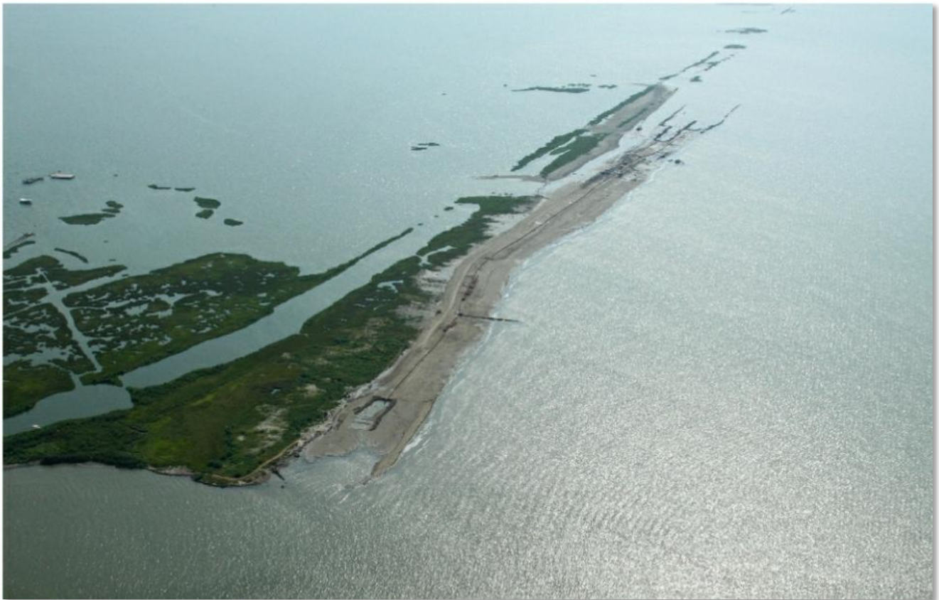
W9 Berm – August 10, 2010

Shaw Environmental & Infrastructure Group