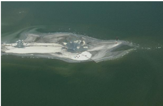
E4 Berm – August 8, 2010

*Berm is advancing about 500 LF per reach per day