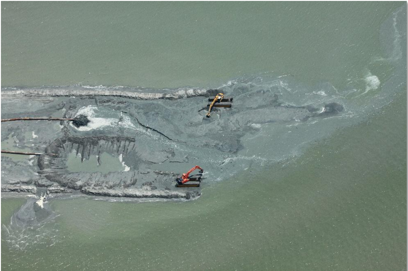
E4 North Berm Construction– August 8, 2010

Prepared by: Shaw Environmental & Infrastructure Group