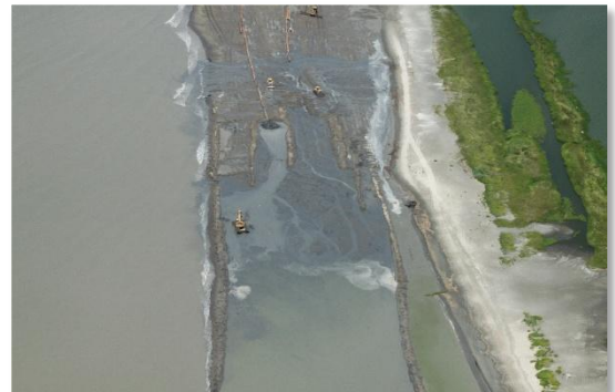
W9 Berm Construction – August 8, 2010